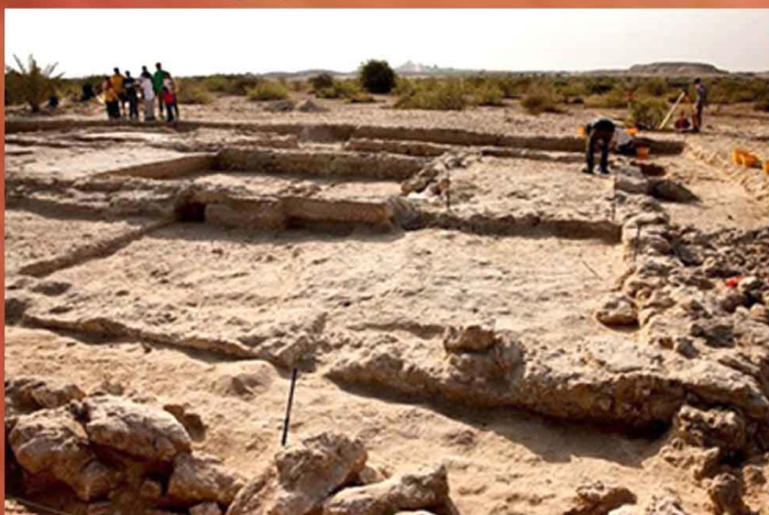
Photo of Christian monastery in 600 A.D. in Abu Dhabi, UAE