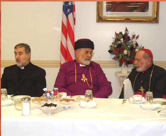
H.H. Mar Dinkha Visits Mar Narsai Metropolitan at Ancient Church of the East's Chicago parish, St Odisho's Church.