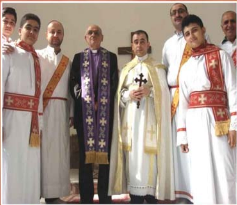
Priest & clergy in Damascus, Syria