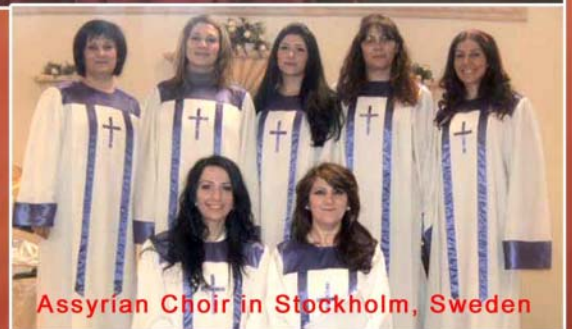
Assyrian Choir in Stockholm, Sweden