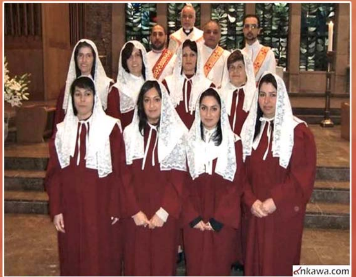
Diocese of Europe – Choir Group - Germany