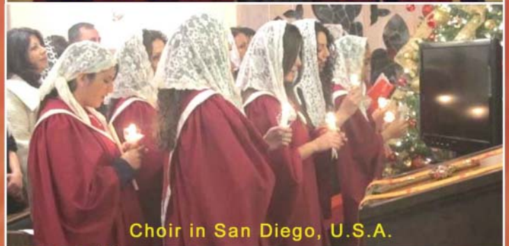
Choir in San Diego, U.S.A.