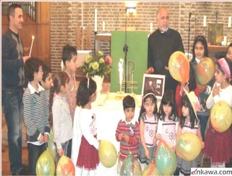
Vicar and parishioners in Netherlands.