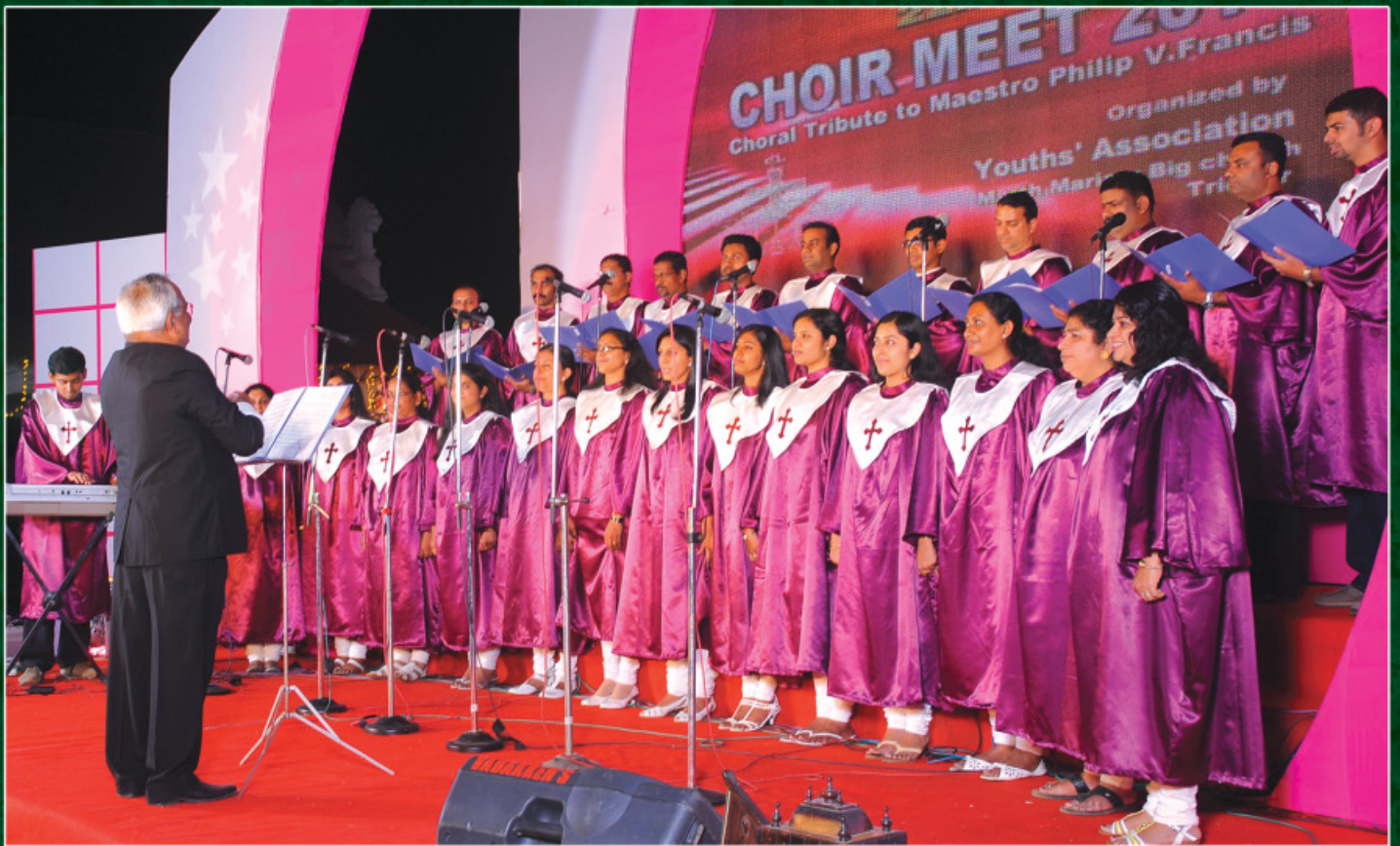
Bangalore Parish Choir performing for 1st prize in Choir Meet, Thrissur, 25 December 2011.