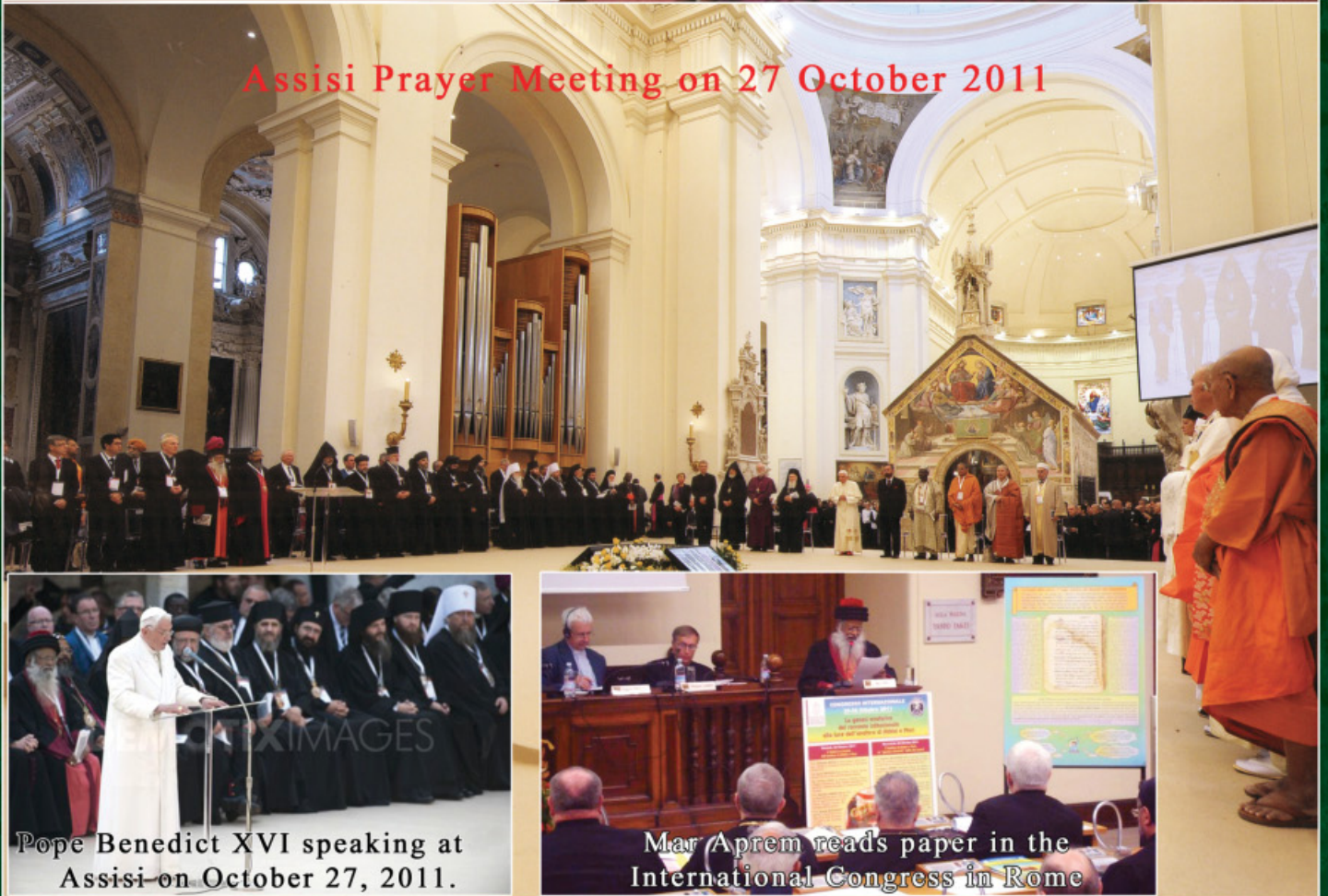
Assisi Prayer Meeting on 27 October 2011