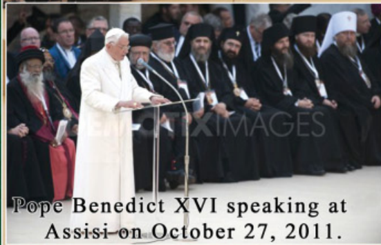
Pope Benedict XVI speaking at Assisi on October 27, 2011.