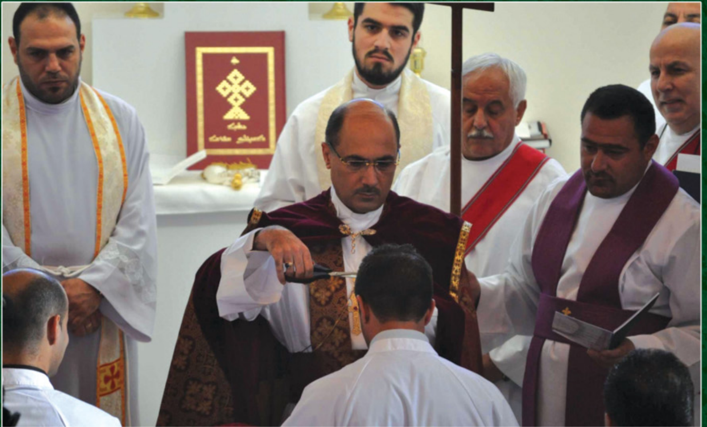
H.B. Mar Meelis Zaia AM, Metropolitan, Ordains Two Deacons in Melbourne, Australia on 22 January 2012