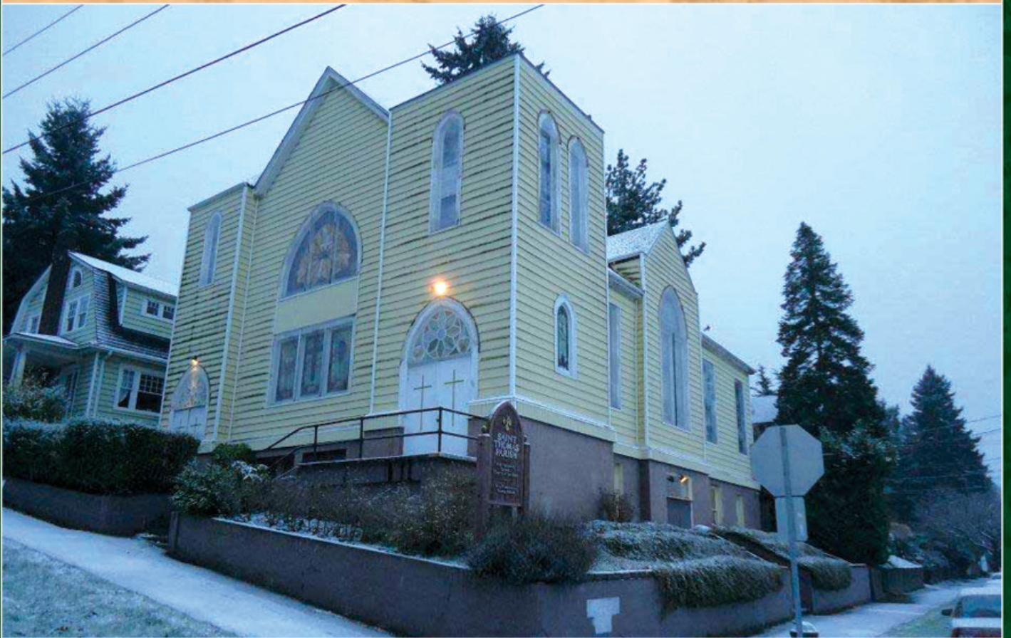
St. Thomas Church, Seattle, Washington, USA