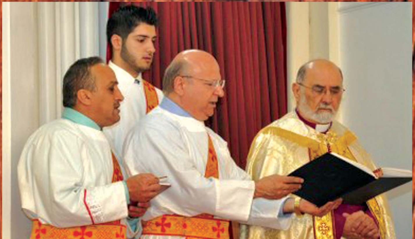
H.H. Mar Dinkha IV, Catholicos Patriarch pictured at St George Cathedral in Chicago during the Commemoration of St George the Martyr in April 2012.