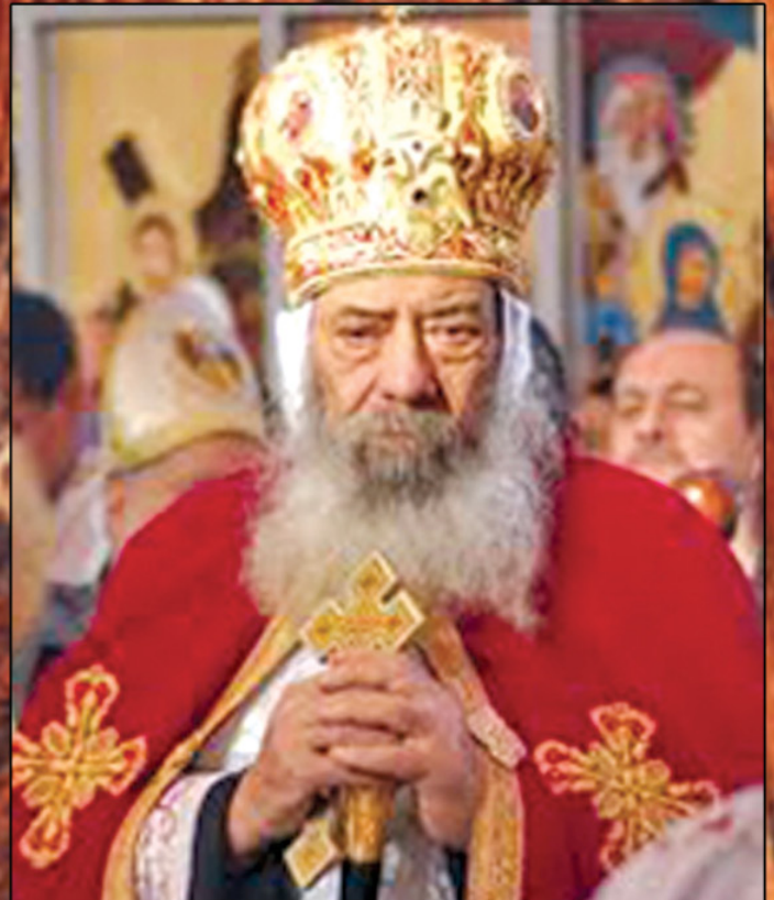
The leader of Egypt's Coptic Church, Pope Shenouda III died in Cairo on 17 March 2012.