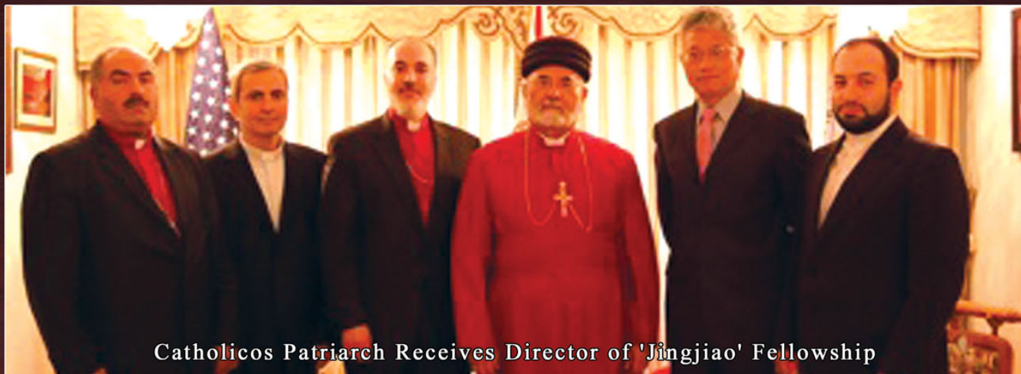
Catholicos Patriarch Receives Director of 'Jingjiao' Fellowship