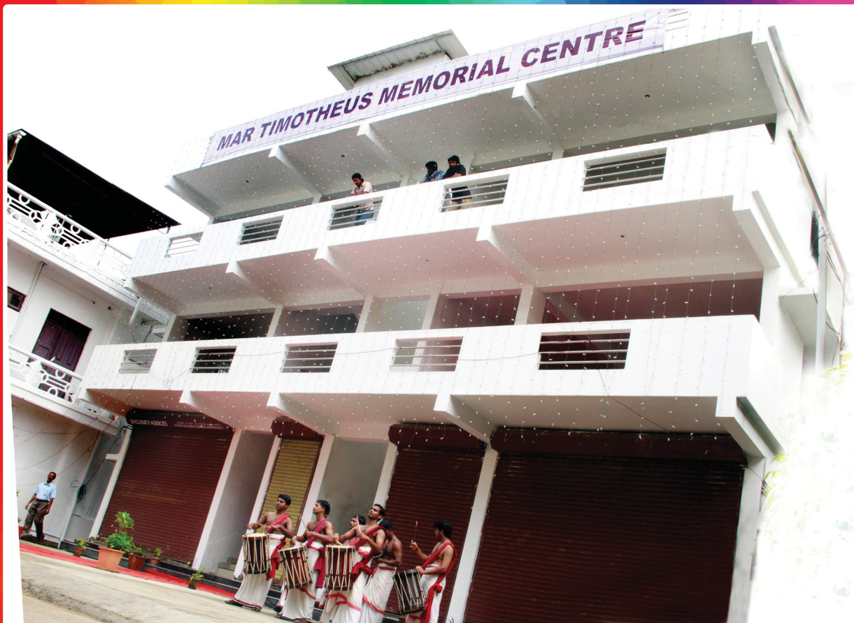
Newly constructed shopping complex and parsonage in the premises of St. Thomas Church, Ernakulam, Kochi