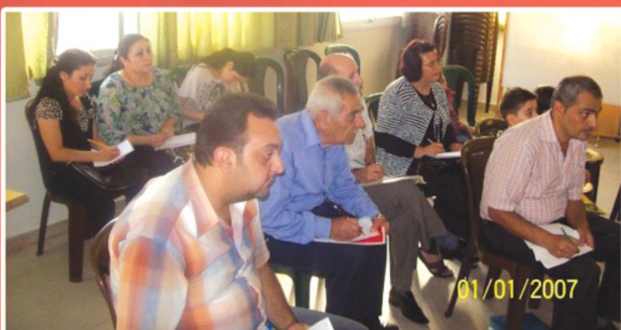
Photo taken at the official commencement of new School of Edessa at St. George Parish in Jaramana, Damascus on 27th September 2011.