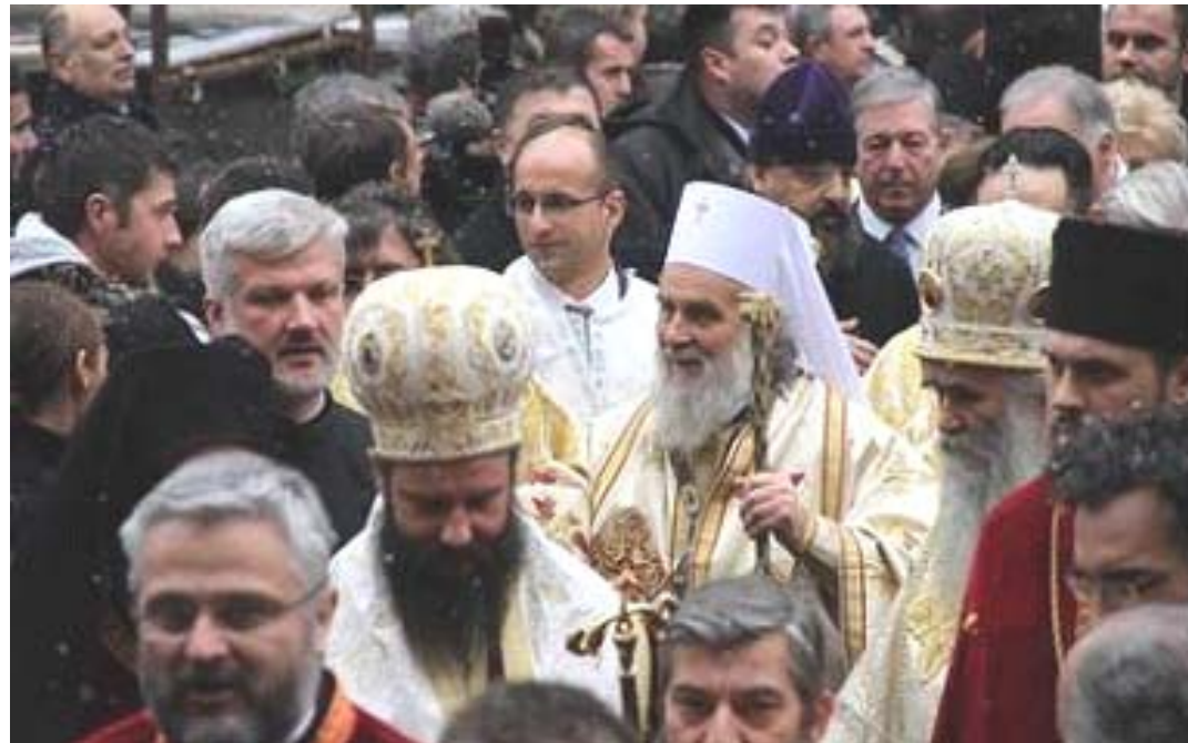
Serbian Orthodox Church is based in Serbia and Montenegro. It has 8 million members, 45 bishops. Priests 3000 in 37 dioceses.