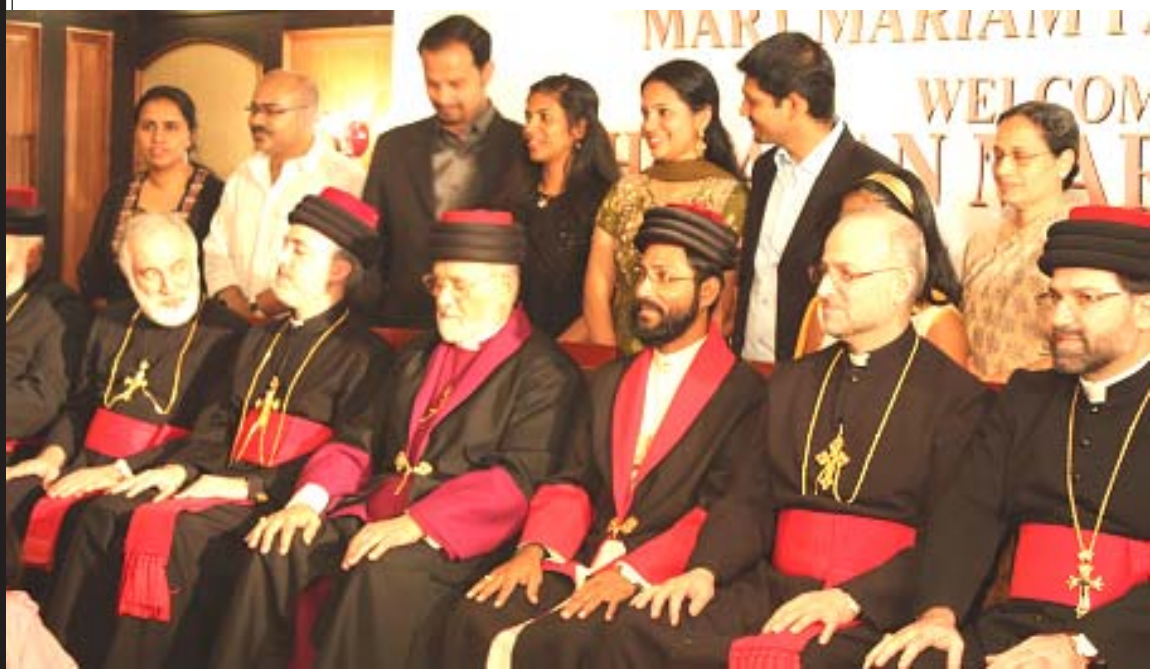
Patriarch and prelates with some parishioners in UAE

Our priests get a 13 th month salary in April every year as festival allowance.