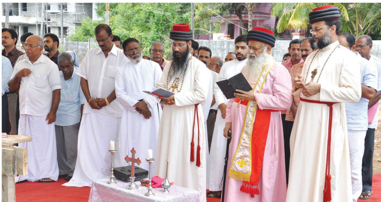
Blessing of foundation stone by Mar Aprem Metropolitan for H. H. Mar Dinkha IV Assyrian Convent in Kalathode, Thrissur on 26 April 2015