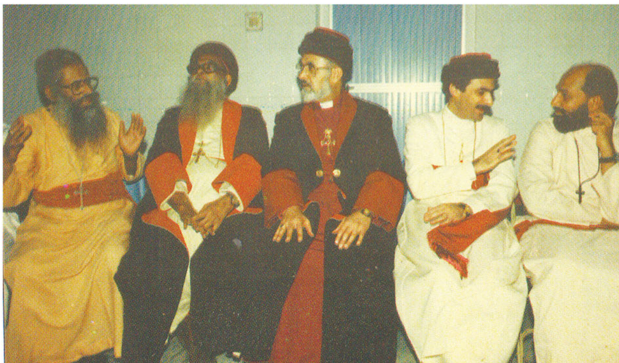
The first Indian visit of Late H.H. Mar Dinkha IV (January 1991) after his Patriarchal consecration in October 1976.