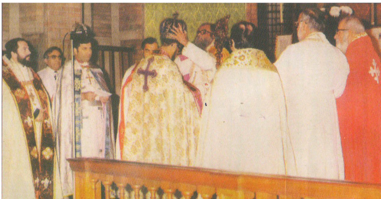
Mar Timotheus Metropolitan consecrating Mar Dinkha IV as the 120th Patriarch of the Assyrian Church of the East on 17 October 1976.