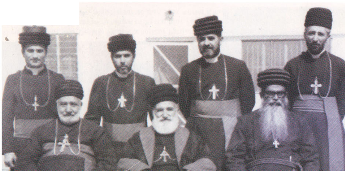
Mar Dinkha IV with Assyrian prelates