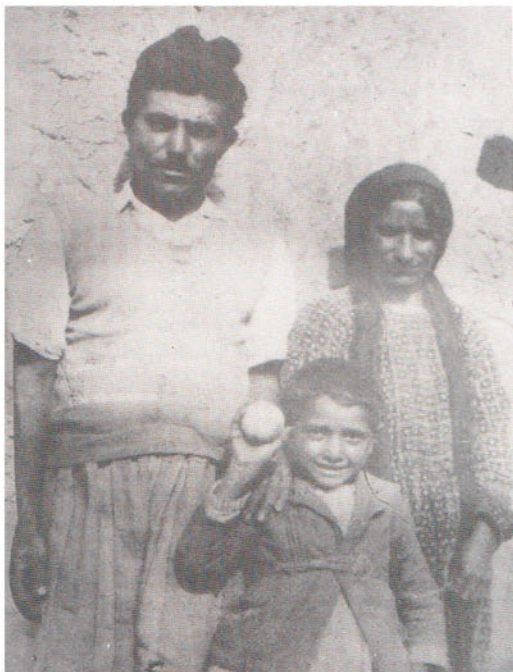
Khanania Mar Dinkha IV with his parents (1940)