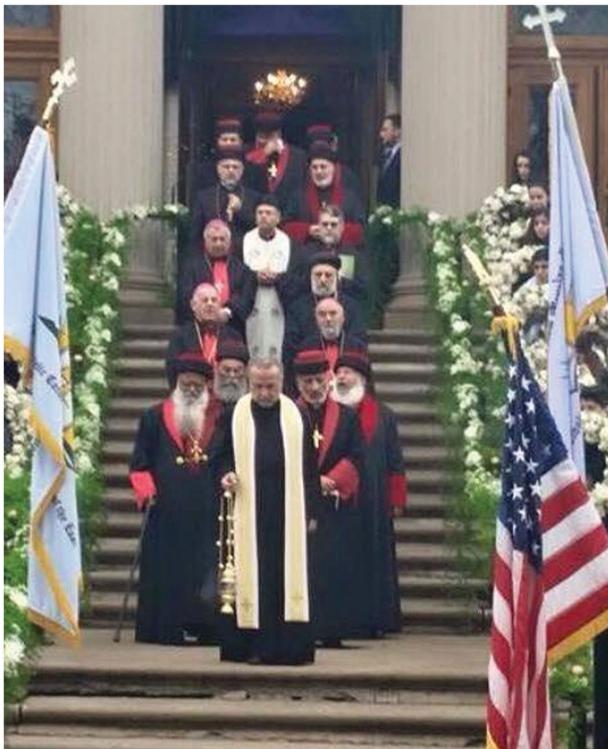
The funeral procession of H. H. Mar Dinkha IV starting from St. Gevarghese Cathedral, Chicago.