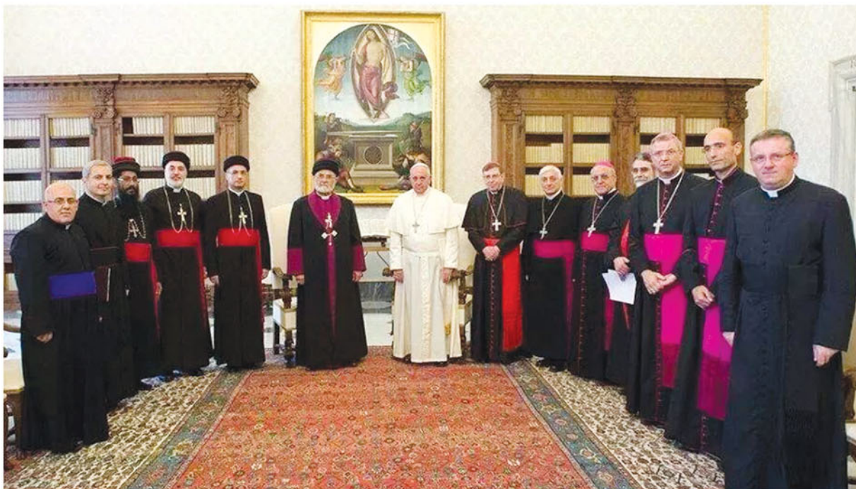
Mar Dinkha IV and the Assyrian prelates visiting Pope Francis along with Catholic Bishops from the Assyrian Vatican Dialogue Committee on 2nd, October 2014 at Vatican.