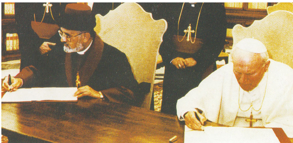
Patriarch H. H. Mar Dinkha IV and Pope John Paul II signing the Common Christological Declaration at Vatican on November 11, 1994.