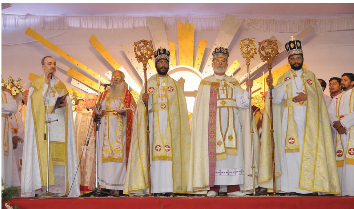
The ceremony of the Episcopal consecration of two bishops in India in connection with the Holy Synod of 2010