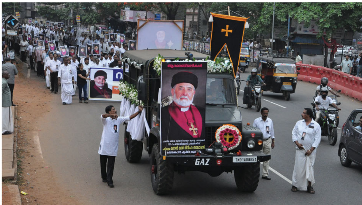
‘Silent procession’ in connection with the passing away of H.H. Mar Dinkha IV in India