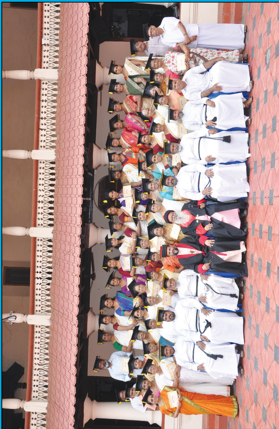
The Institute of Mission & Evangelism of the Church of the East (IMECE). 1st batch of 1st year Bible Course conducted by the Gospel Association, Church of the East (2014-15) on 17th June 2015