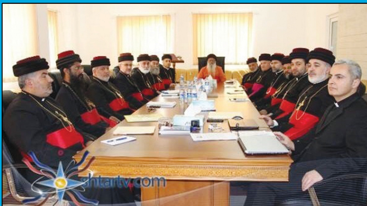
The Council of Prelates of the Assyrian Church of the East Arbil, Northern Iraq, June 2015