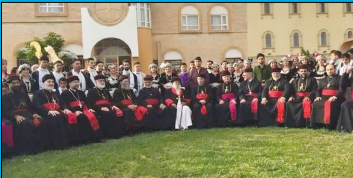
The Holy Council of Prelates of the Assyrian Church of the East 4 June 2015