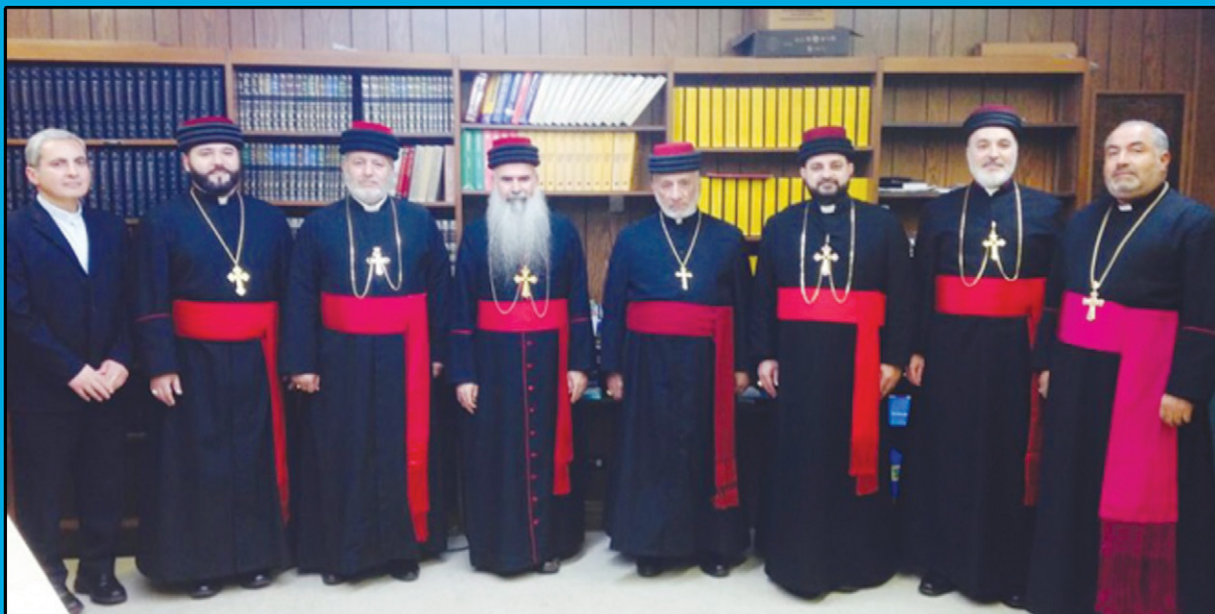
After the meeting between the delegations of the Assyrian Church of the East and the Ancient Church of the East in Chicago, IL USA on Friday, the 22nd of May 2015