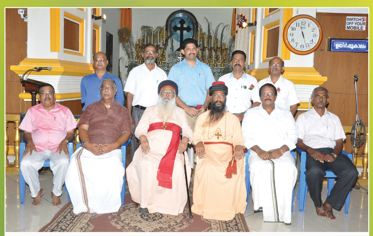
The newly elected Board of Central Trustees for the period of April 1, 2016 to March 31, 2017