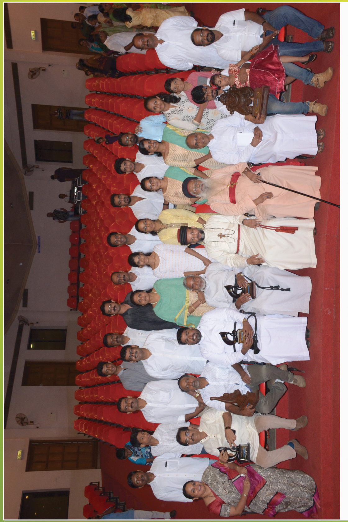
Photo taken in connection with the release of a CD of 100 traditional songs of (GAANAMAALIKA) in Trichur on 12 June 2016