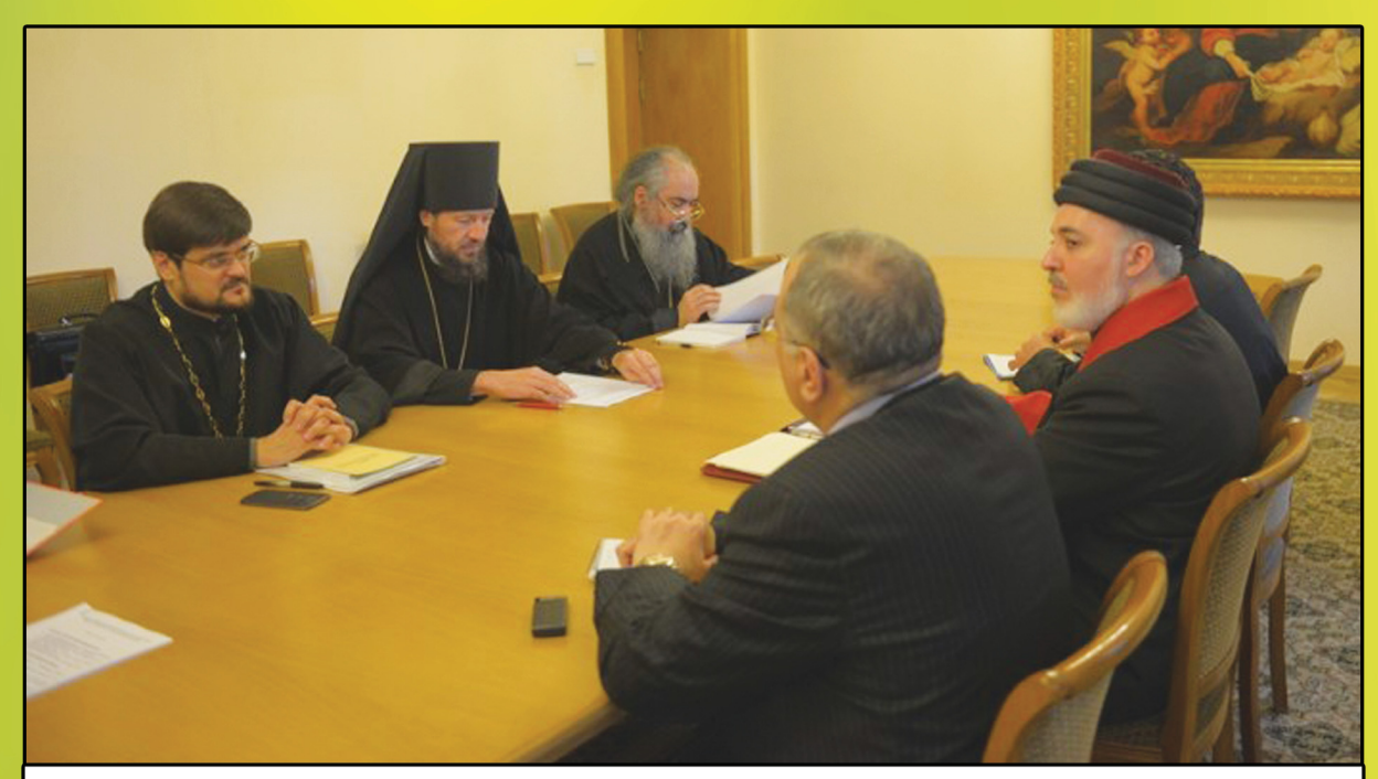
First Session of the Commission for Bilateral Dialogue between the Russian Orthodox Church and the Assyrian Church of the East