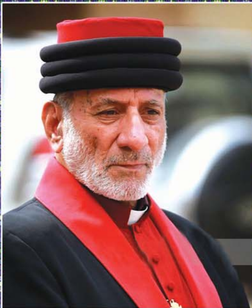
H.H. Mar Gewargis III Sliwa Catholicos-Patriarch of the Assyrian Church of the East