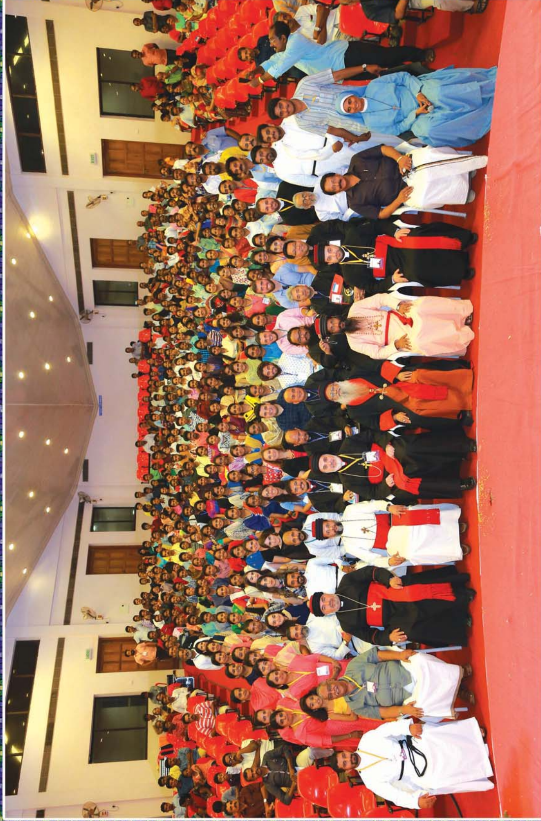
Participants in the Youth Conference 2016 at Thrissur along with prelates, priests, foreign delegates, and with the Board of Central Trustees