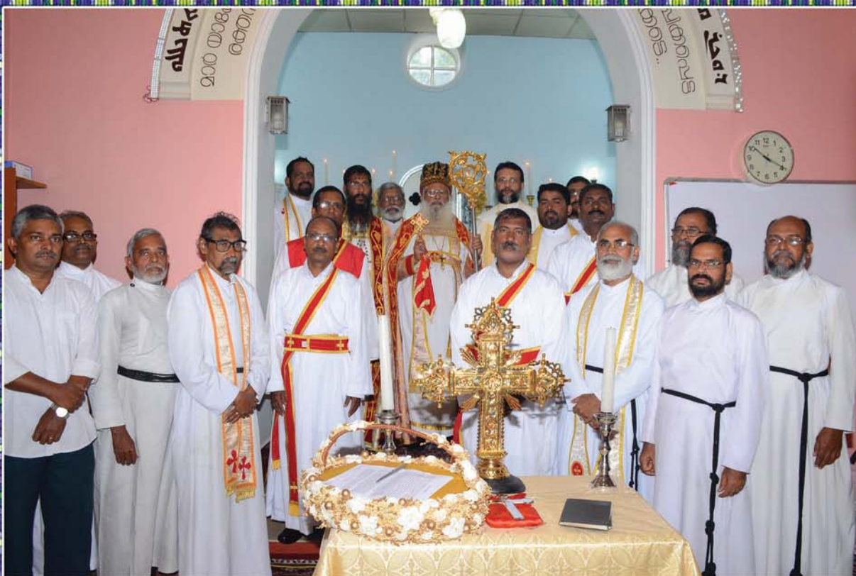
Ordination of Three Deacons Mar Yacob M'Paska Church, Peechi – 15 July 2016