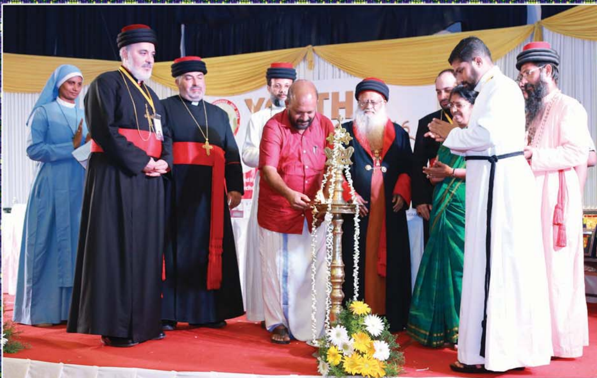
Valedictory Function on 24 July 2016, the 4th Day of the Youth Conference 2016 Inaugurated by Honourable Minister for Agriculture Adv. V.S. Sunil Kumar