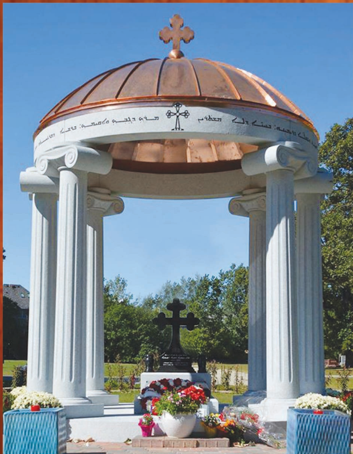
Shrine of His Holiness Late Mar Dinkha IV