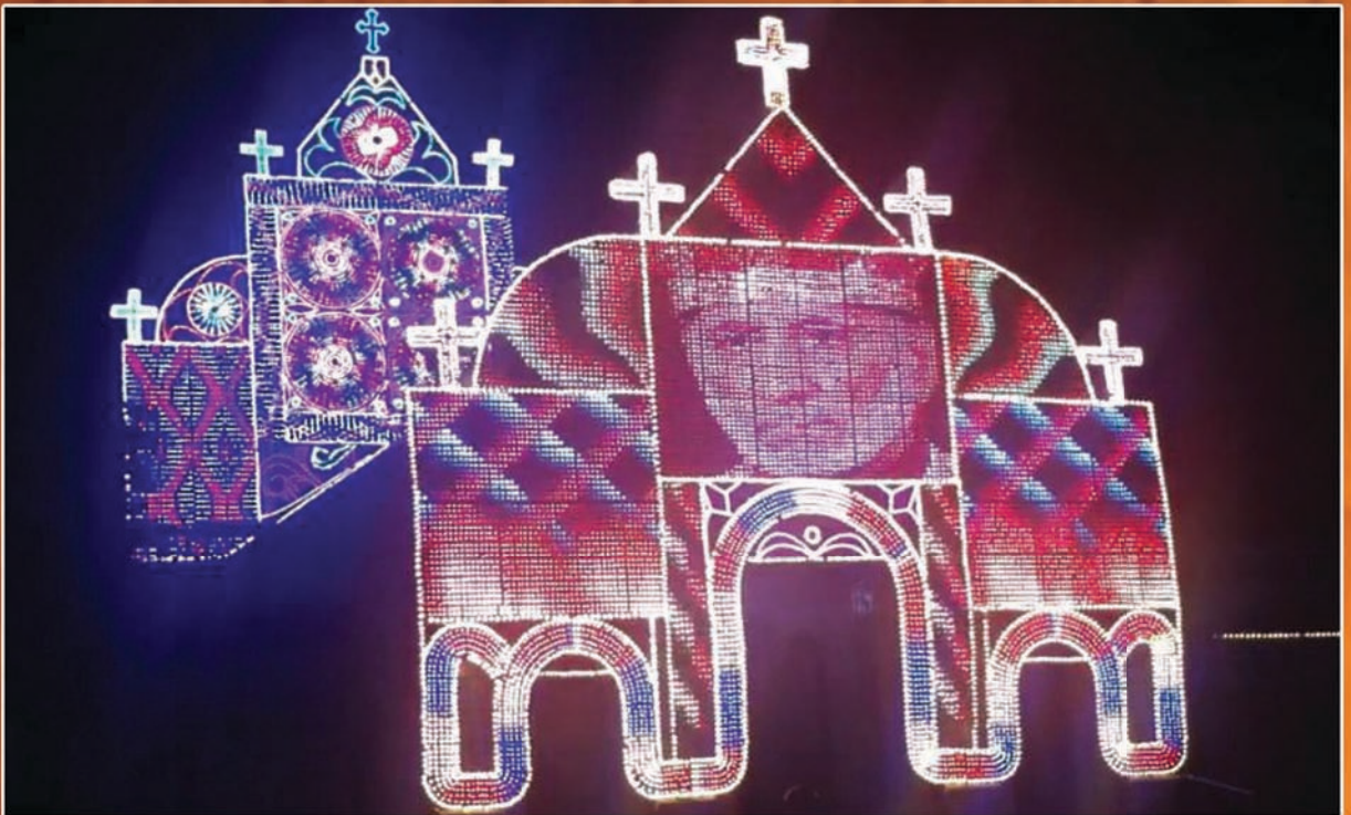
Mart Mariam Big Church, Trichur Illuminated in connection with the Qudash Edtha Festival on 30 October 2016. The figure of Patriarch Mar Gewargis III is shining in the frontage of Cathedral.