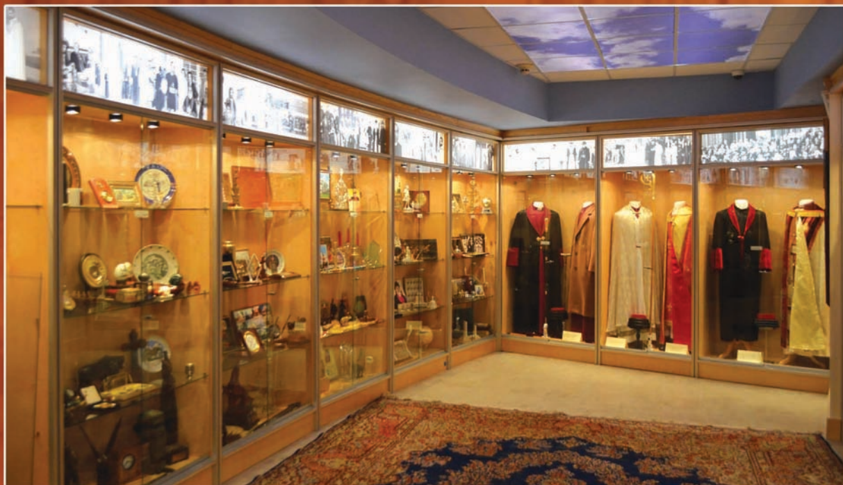
Museum with articles of Late Patriarch Mar Dinkha IV, Chicago