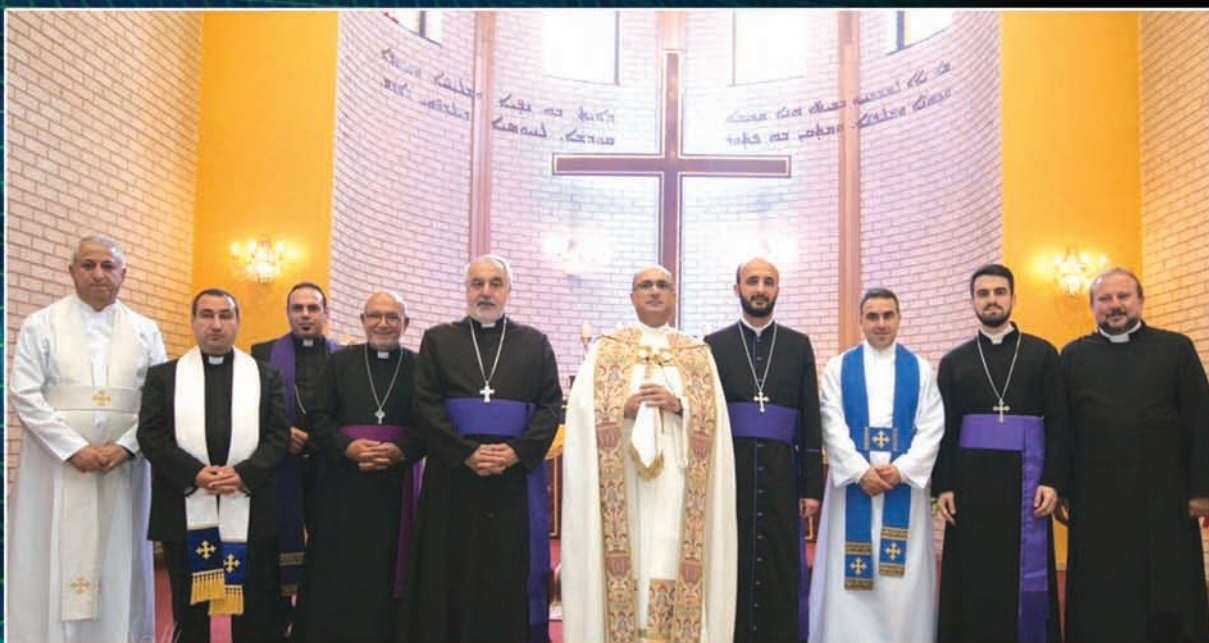
His Beatitude Mar Meelis Zaia AM, Metropolitan and clergy along with the five newly ordained and elevated priests of the Assyrian Church of the East in Australia - 26 March 2017