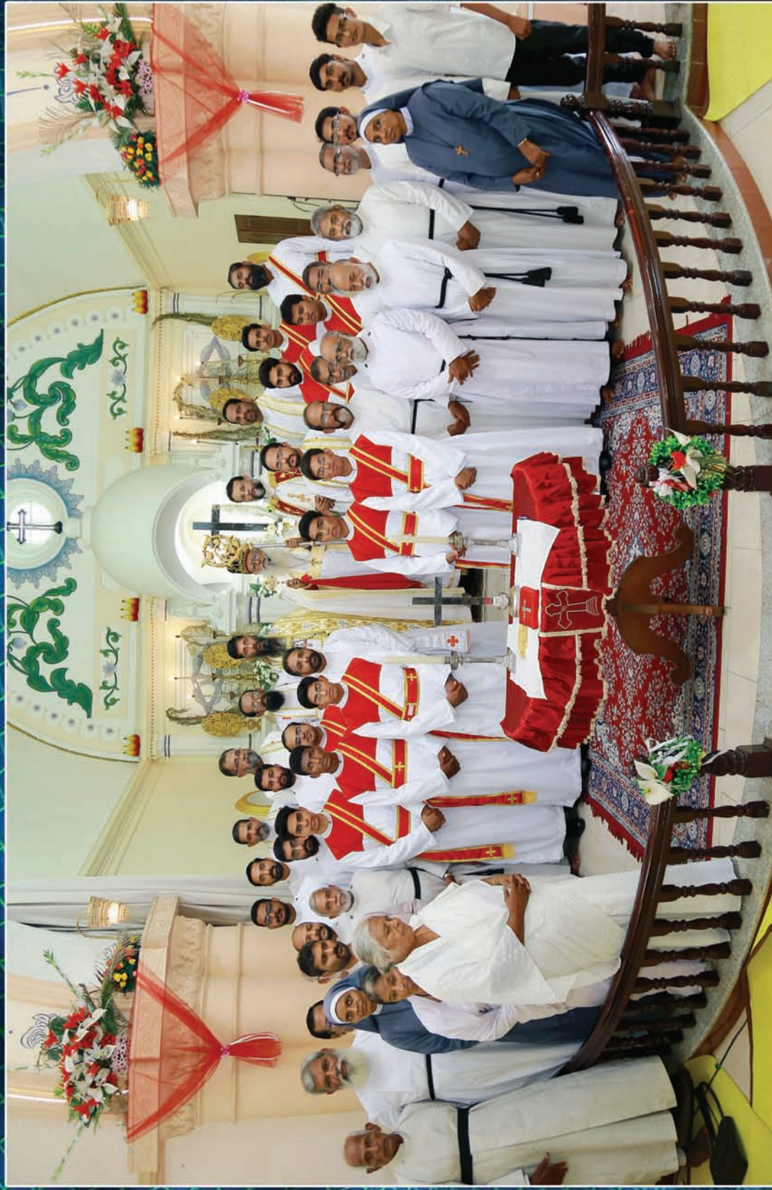
5 Newly Ordained Deacons with Prelates, Clergy and Nuns in Mar Aprem Church Chelakottukara, Thrissur on 29 April 2017.