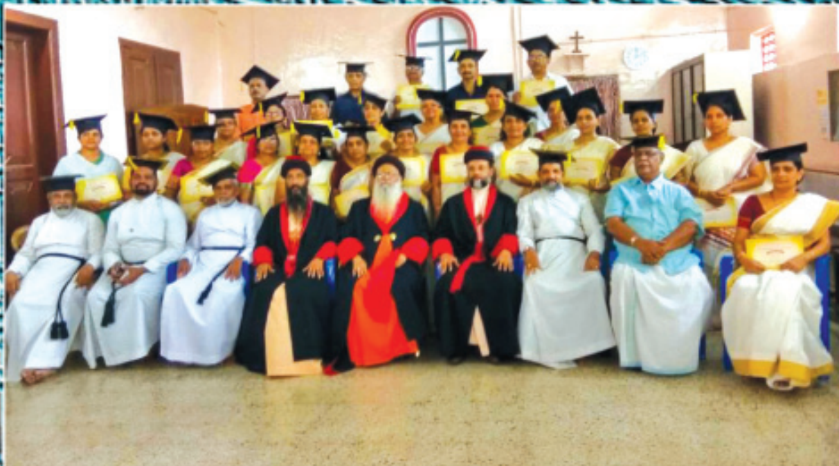
The Institute of Evangelism & Mission of the Church of the East was held on 14 June 2017. The Metropolitan and two bishops were present and twenty five students received diplomas