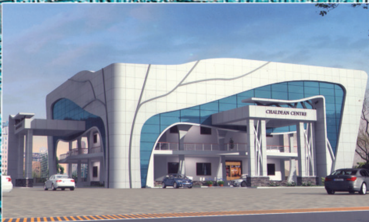
The renovated Chaldean Centre Thrissur – 13 June 2017