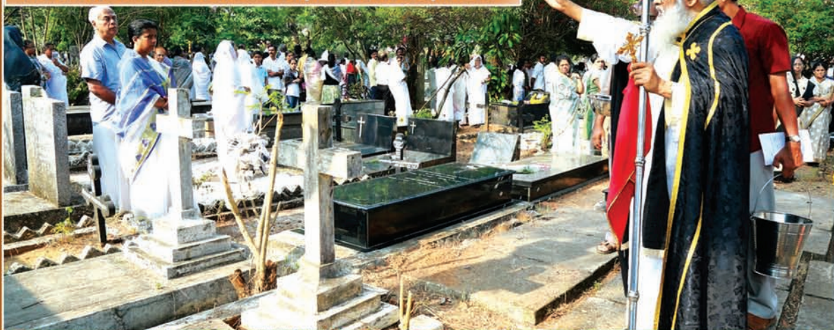
The Commemoration of Anneedhe (Friday of the Departed) in the Cemetery of Mar Yohannan Mamdhana Church, East Fort, Thrissur and Mar Addai Sreeha Church, Paravattani, Thrissur on Friday 9 February 2018