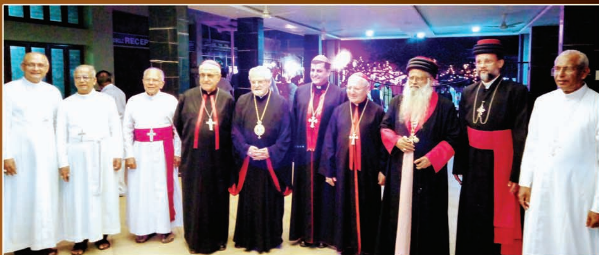
The Chaldean Catholic Patriarch of Iraq, Louis I Raphael Sako Visiting Thrissur on 14 January 2018 in Connection with the Silver Jubilee of the Granting of Major Archbishop Status to the Syro Malabar Catholic Church