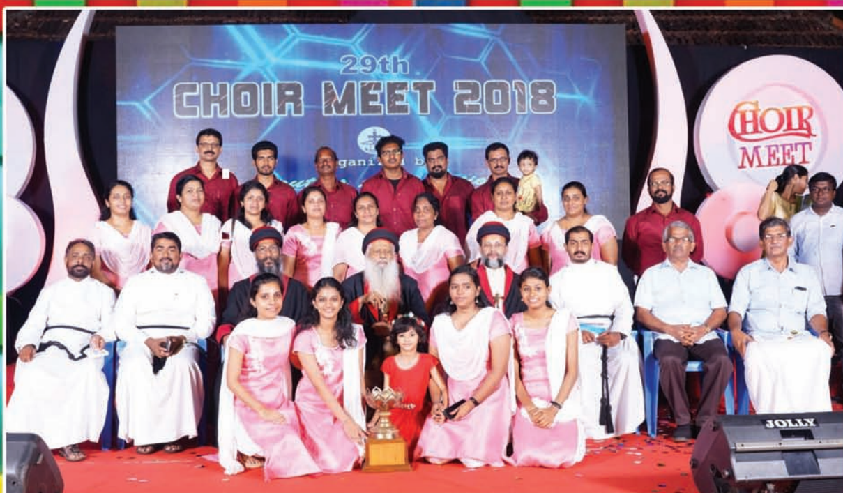
The prelates and priests with Mar Aprem Church Choir, who won the 1st prize in Choir Meet-2018 conducted by the Mart Mariam Parish, Thrissur on 25th December 2018