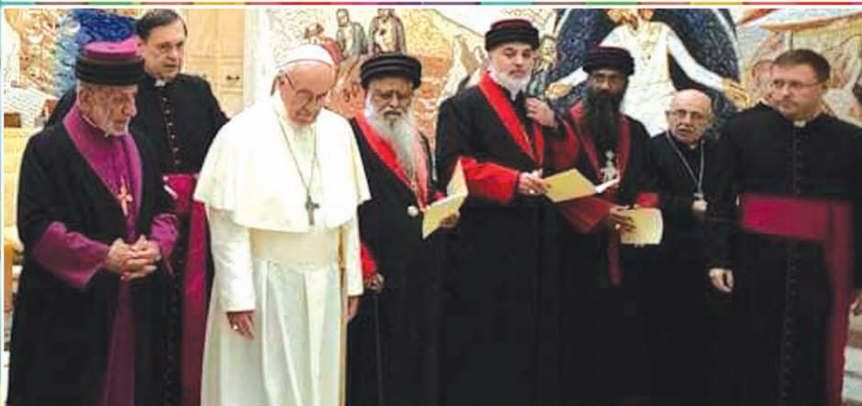
H. H. Mar Gewargis III Sliwa and other prelates of Assyrian Church of the East with the Pope Francis of Catholic Church