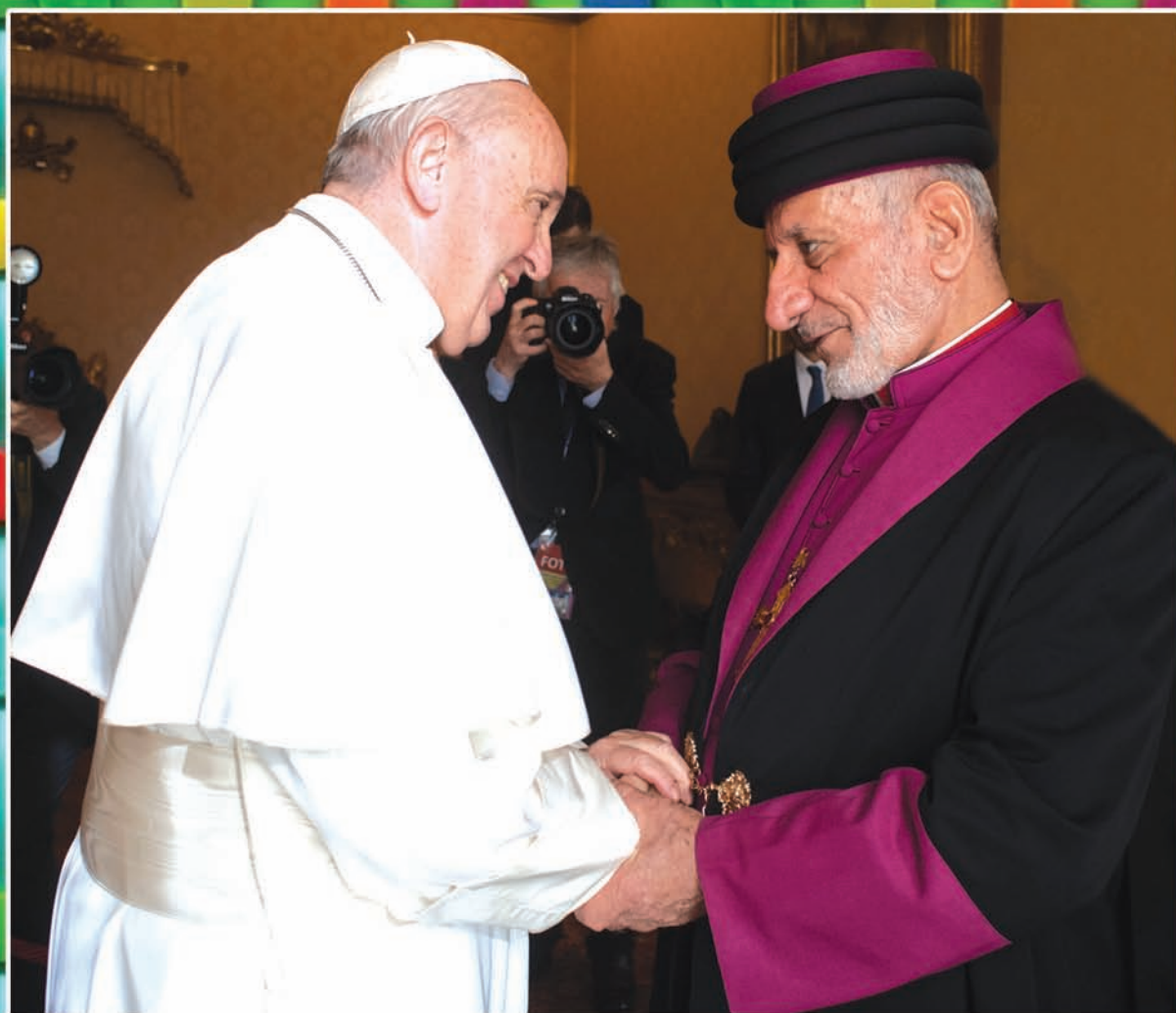
His Holiness Mar Gewargis III Sliwa meets the Pope Francis at Vatican on 09 November 2018

Vol 65 November - December 2018 Nos11 & 12