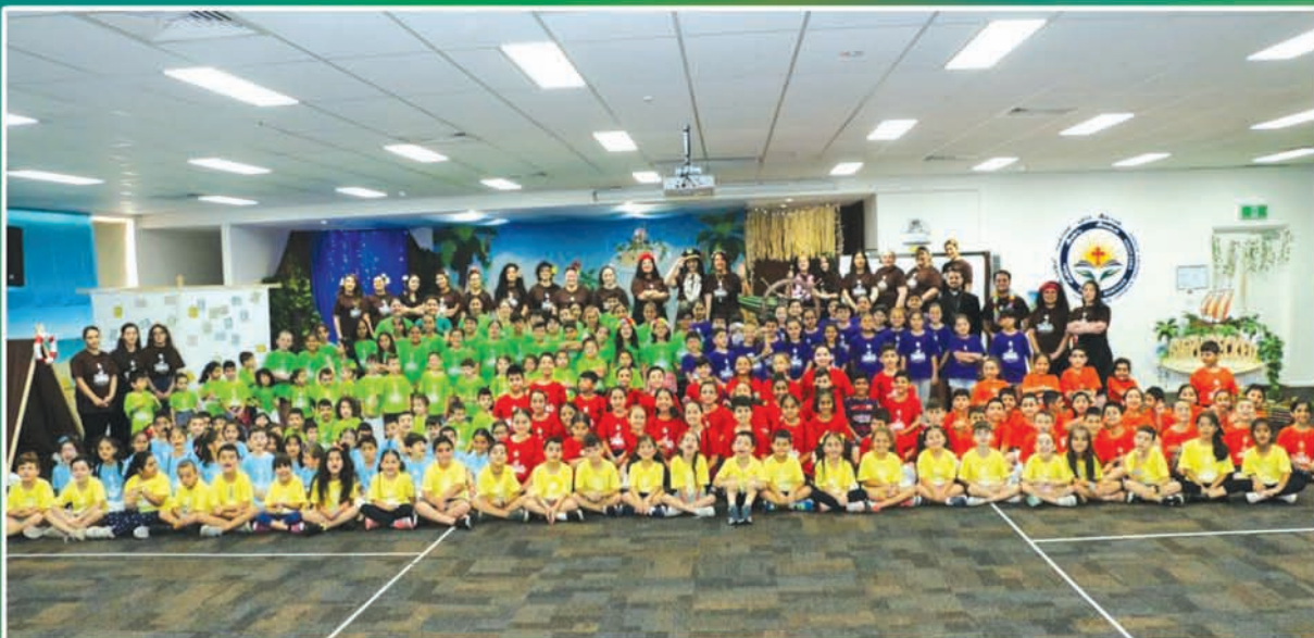
The 2nd Annual Vacation Bible School (VBS) of the Assyrian Church of the East Children's Association (ACECA) in Sydney held at St Hurmizd Assyrian Primary School, Greenfield Park, January 7-11, 2019