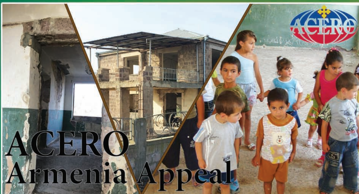
Renovating a two-floor building into an Assyrian kindergarten in the village of Verin Dvin, Armenia supported by ACERO's Armenia Appeal