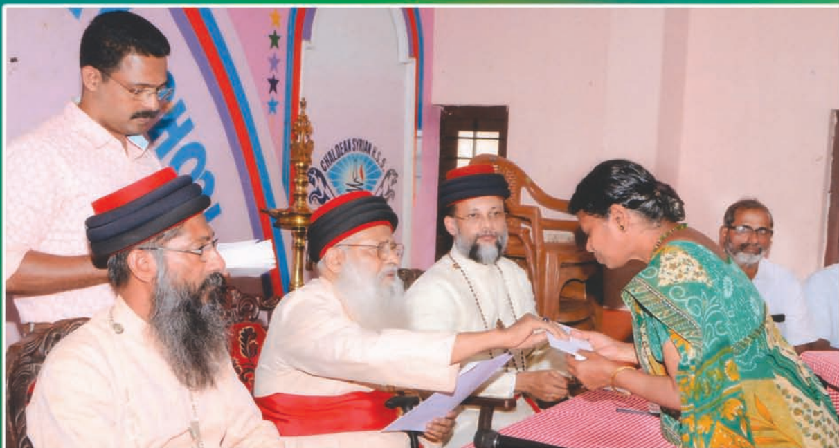
H.G. Mar Aprem Metropolitan inaugurates the distribution of the flood relief fund with two Episcopas collected by the Charitable Trust at Chaldean Syrian School Hall, Thrissur