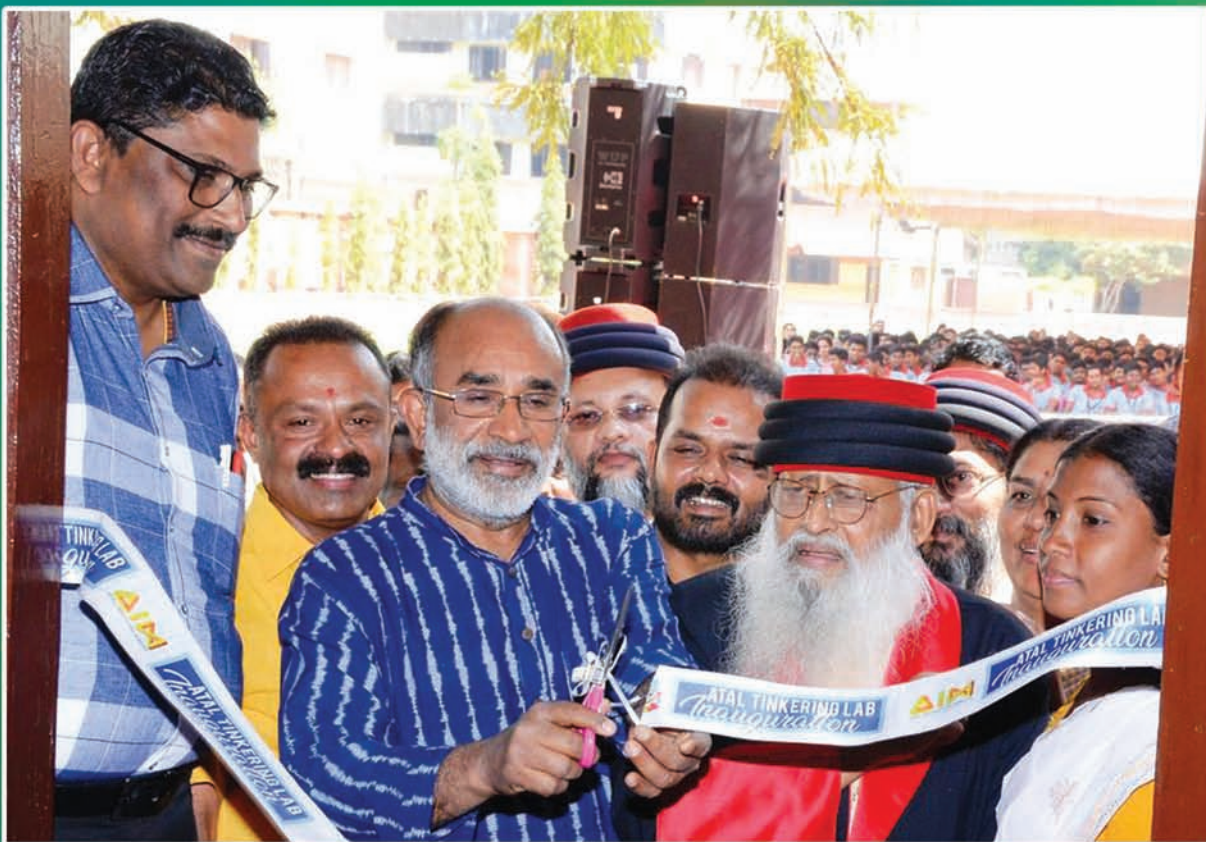
Minister of State Tourism Sri. K.J. Alphons Kannamthanam inaugurates the 'Atal Tinkering Lab' at Chaldean Syrian Higher Secondary School, Thrissur - January 23, 2019