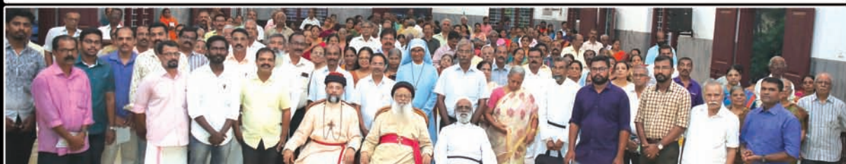
Mar Addai Sreeha Church celebrated the wedding anniversary of couples who lived 25-58 years together at the Silver Jubilee celebration of Savra Convention organised by the Youths' Association of Mar Addai Sreeha Church, Thrissur