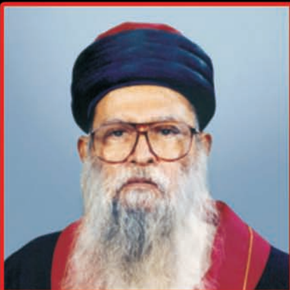
Mar Timotheus Metropolitan d 2001