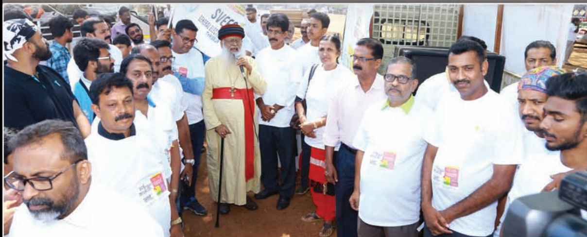
Mar Aprem Metropolitan inaugurates the Bike Rally, conducted for the awareness of 'Voters Right' by the Youths Association Central Committee (Church of the East), Men's Association (Church of the East), JCI (Thrissur Pooram City) and SVEEP (Systematic Voters Election and Electoral Participation) in connection with the Lok Sabha election 2019 in India