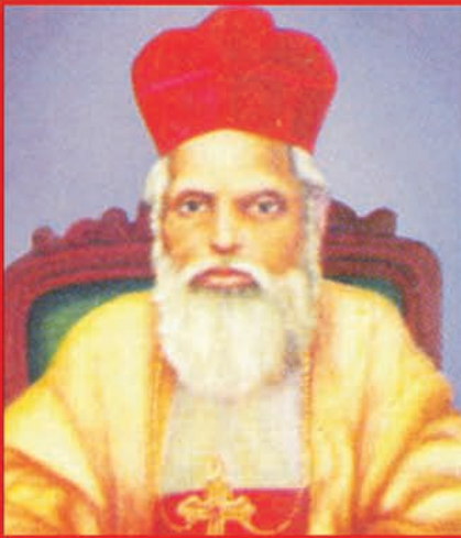
Mar Oudheso Metropolitan d 1900