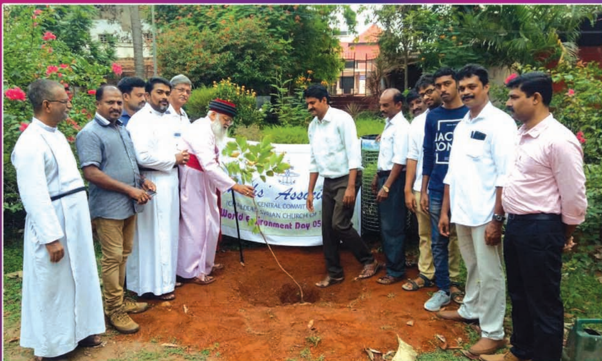
Mar Aprem Metropolitan Inaugurating Environmental Day by planting a tree in the Metropolitan Palace Compound - Conducted by the Central Youths Association, Church of the East