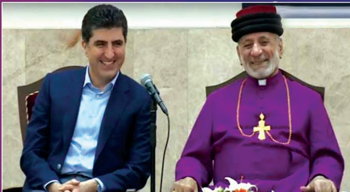
Prime Minister of Iraqi Kurdistan with His Holiness Mar Gewargis III Sliwa, Catholicos-Patriarch