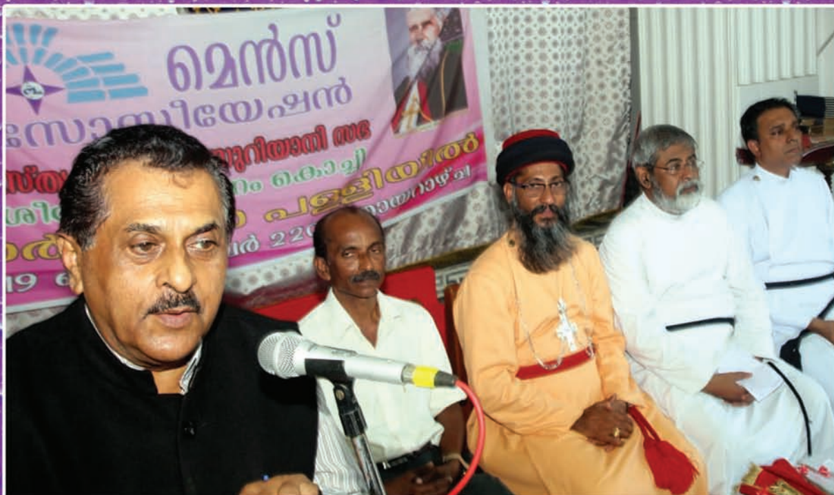
Men's Association National Representative Assembly was inaugurated by Ret. Justice J Benjamin Koshy in Mar Sleeva Parish Cochin on 22 September 2019