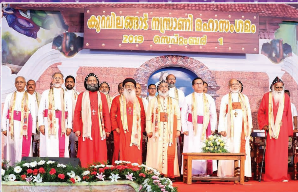
The 'Great Gathering' of all Syrian Churches at Kuravilangadu near Kottayam on 1st Sunday September 2019.