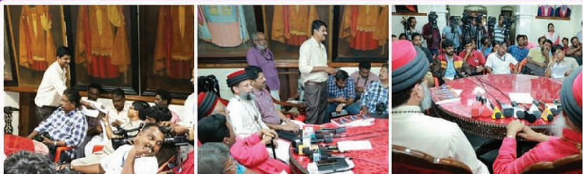
Press Meet in connection with the Sainthood proclamation of Mar Abimalek Timotheus Metropolitan