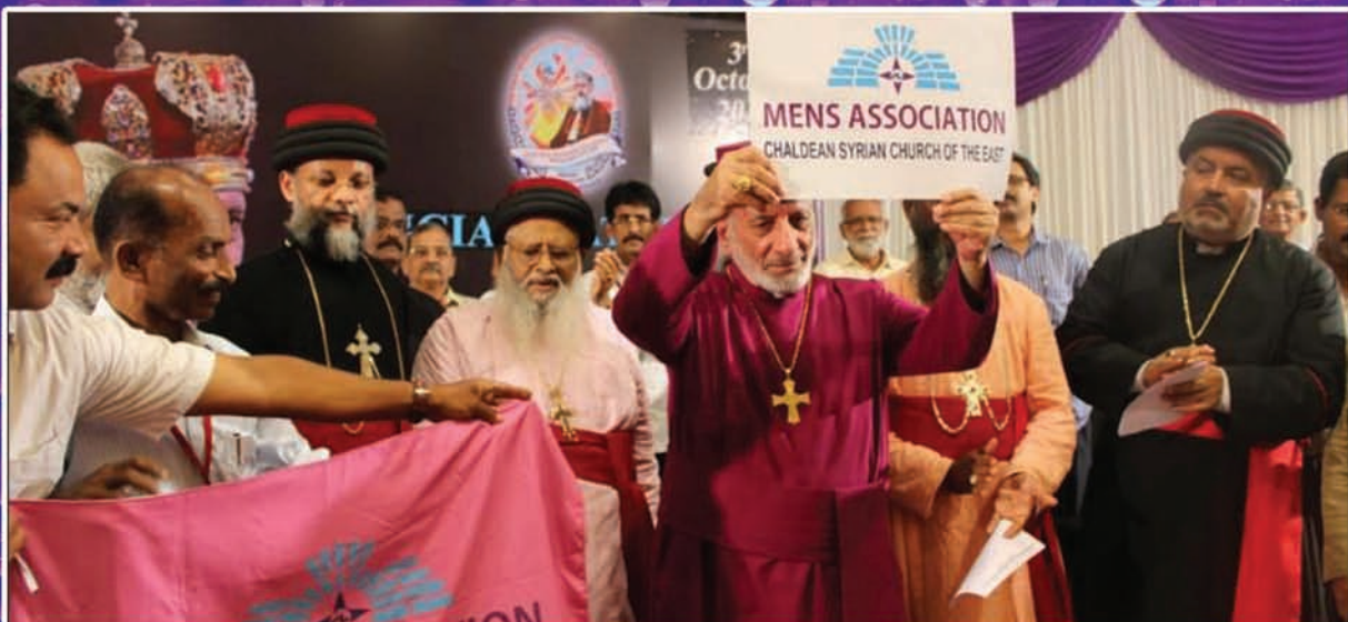
His Holiness Maran Mar Gewargis III Sliwa revealing the new logo of the Mens' Association of the Church of the East, India.