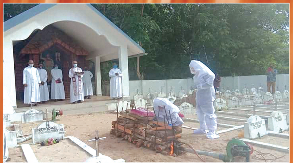
The first historic cremation service held at Roman Catholic (Latin Rite) St. Augustine's Church, Cemetery, Mararikulam under the leadership of prelates and Task Force of Diocese of Alappuzha