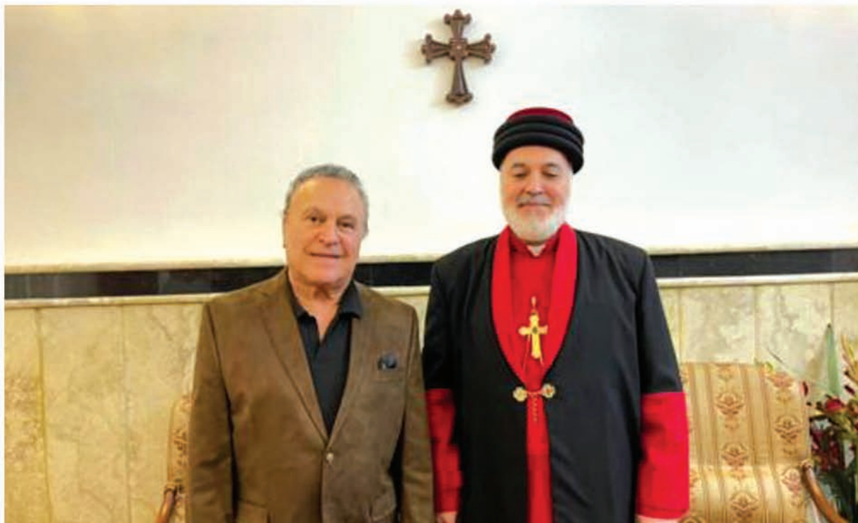
On 21 September 2021, famous Assyrian singer, Mr. Evin Agassi paid a visit of honor to His Holiness the Catholicos-Patriarch