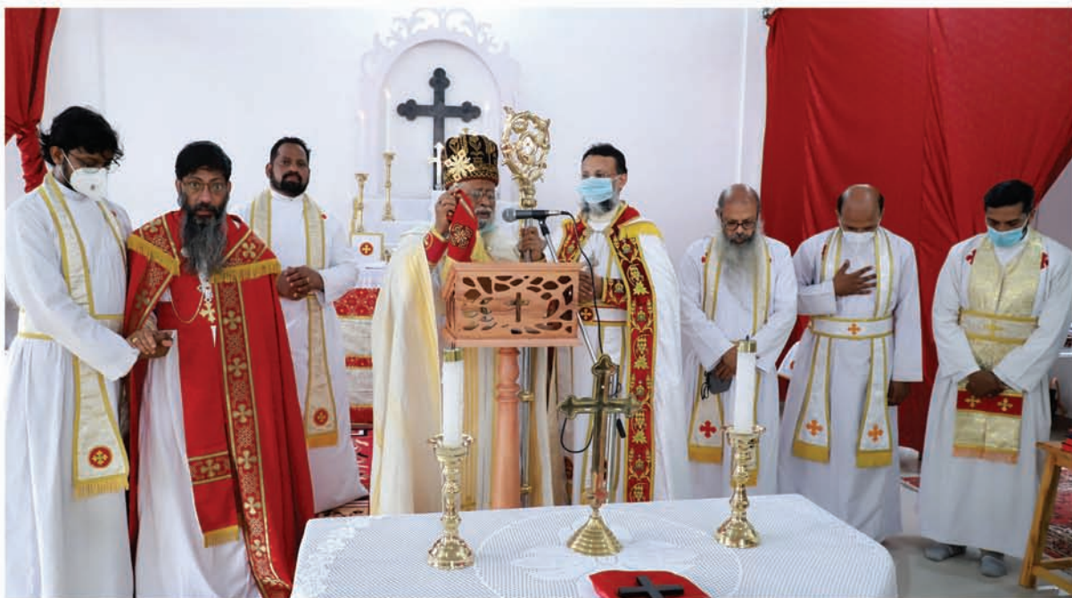
H. G. Dr. Mar Aprem Metropolitan led the consecration ceremony of the new Mar Marcos Church, Mundur along with two Episcopas and priests on 3 October 2021