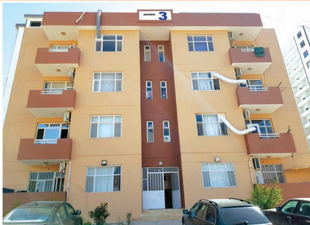
One of ACERO's Dohuk housing buildings during renovations