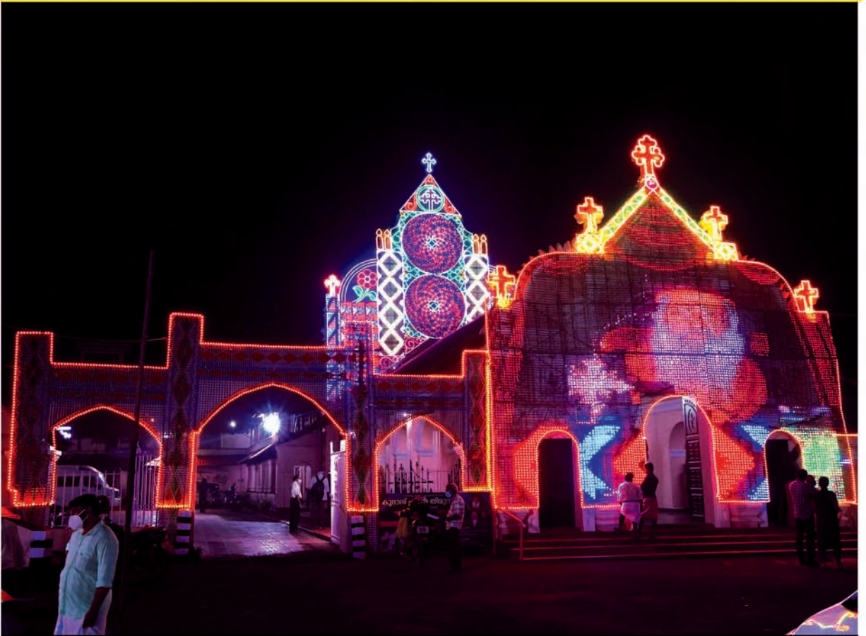
Valiyapalli, (Marth Mariam Big Church) illuminated in connection with the Qudash Eatha Festival - 2021