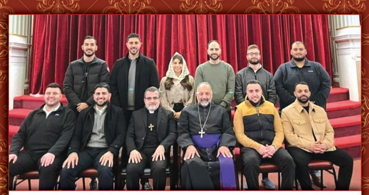
The National Executive Committee members of ACEYA-USA