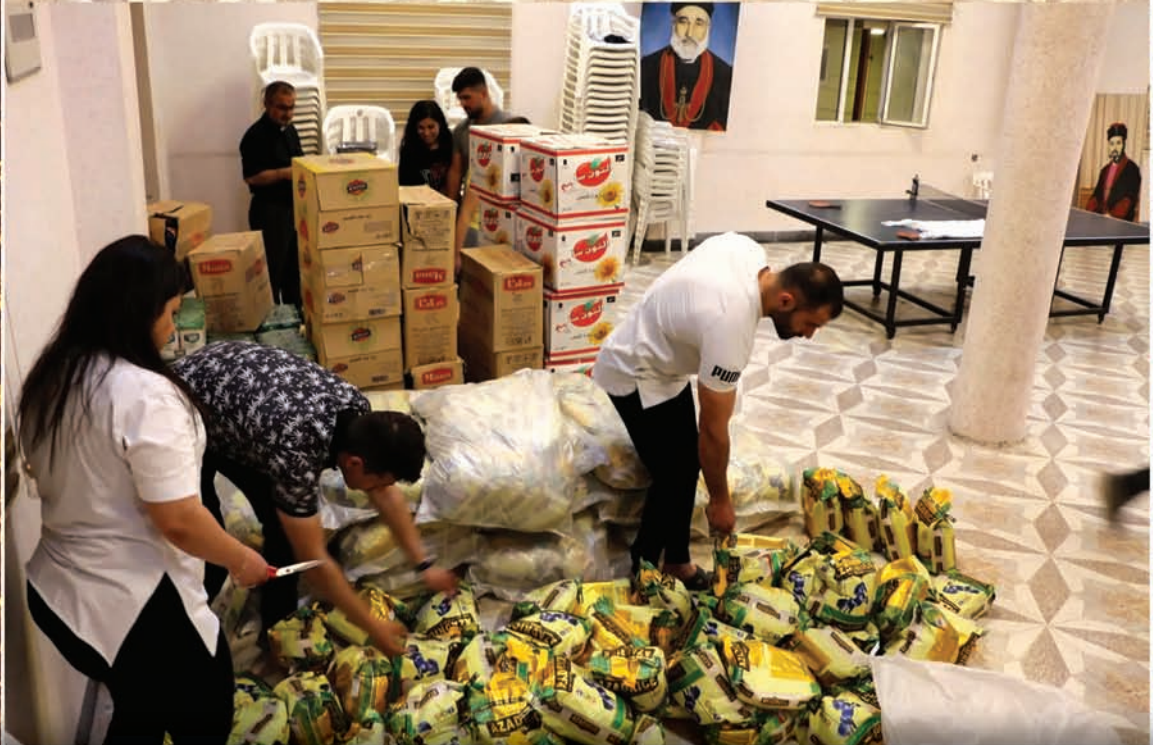
ACERO distributing food parcels and aid to families facing economic hardship in Assyrian villages in the North of Iraq – June 2022