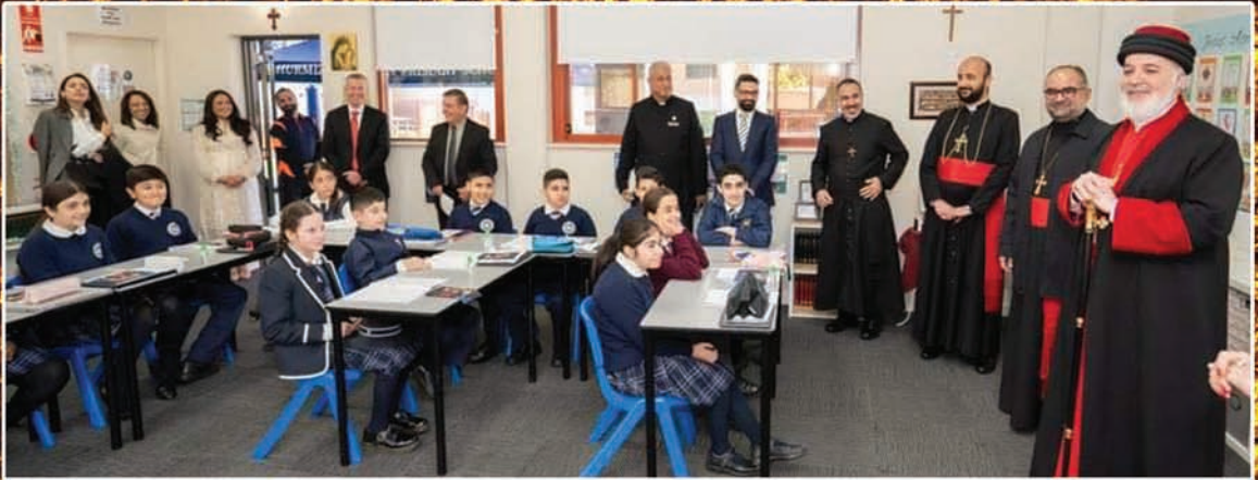
His Holiness Mar Awa III, Catholicos-Patriarch, visits St Hurmizd Assyrian Primary School in Sydney, Australia on 24 May 2022