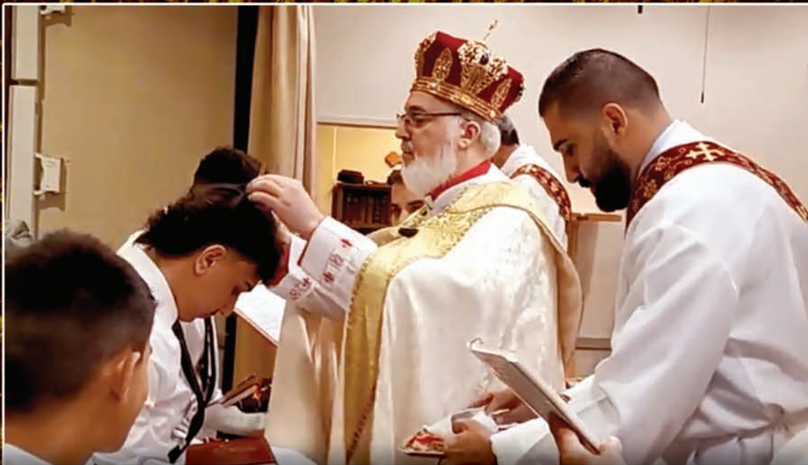
His Holiness Mar Awa III cuts the hair of brothers at the ordination service conducted at Mar Addai Parish, Turlock on Sunday June 12, 2022