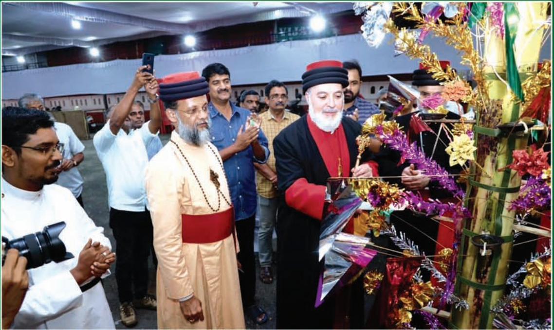
Catholicos-Patriarch HH Mar Awa III celebrating Feast of Epiphany at Marth Mariam Cathedral - Big Church, Thrissur