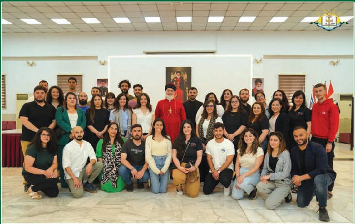
His Holiness Mar Awa III with the Assyrian Youth from USA, Canada, Europe, and Australia