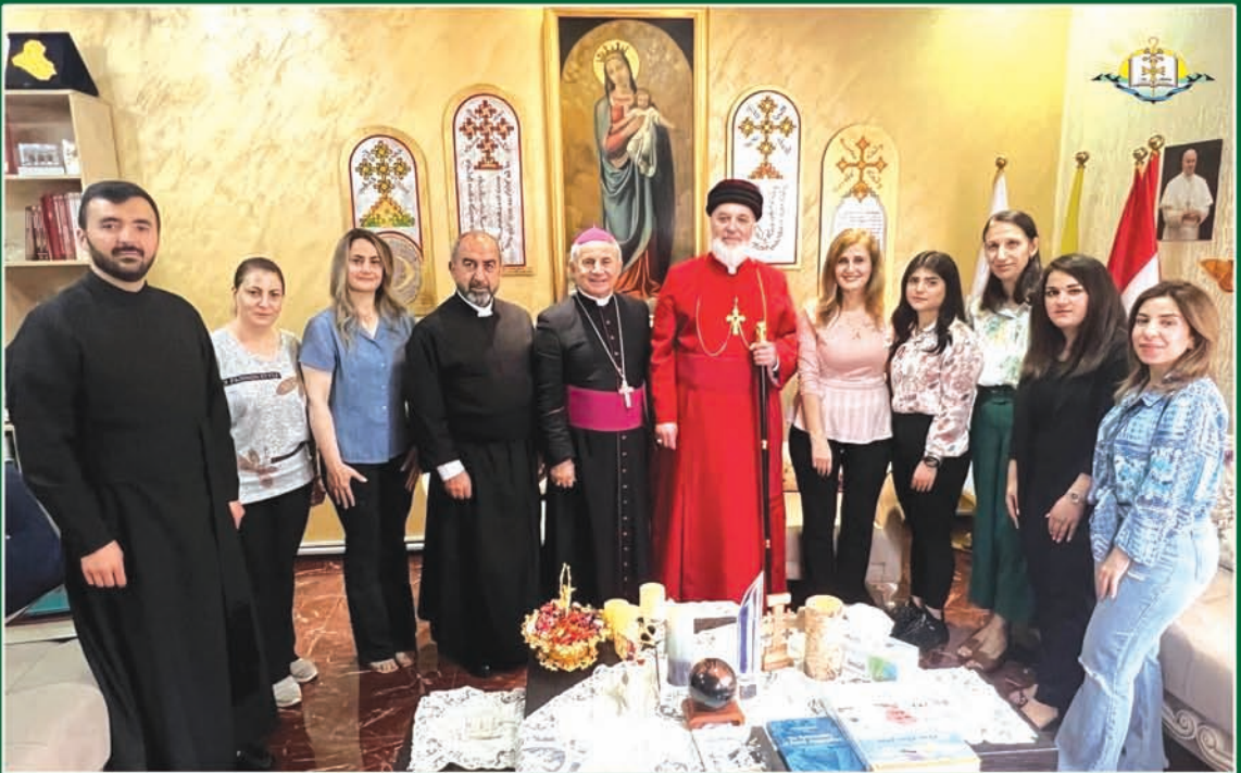
His Holiness Mar Awa III, Catholicos-Patriarch visiting the Digital Center of Oriental Manuscripts on Thursday 20 April 2023.