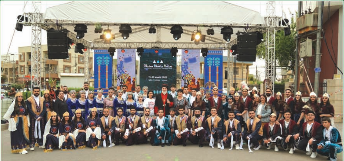
His Holiness Mar Awa III, Catholicos Patriarch with the participants in the Third Annual 'Syriac Heritage Festival' in Ankawa on Tuesday, April 11, 2023.