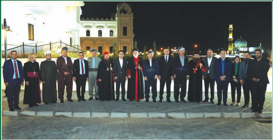
His Holiness Mar Awa III with guests at the Iftar (Fast-Breaking banquet) at the Assyrian Patriarchate in Erbil on Wednesday, April 19, 2023.