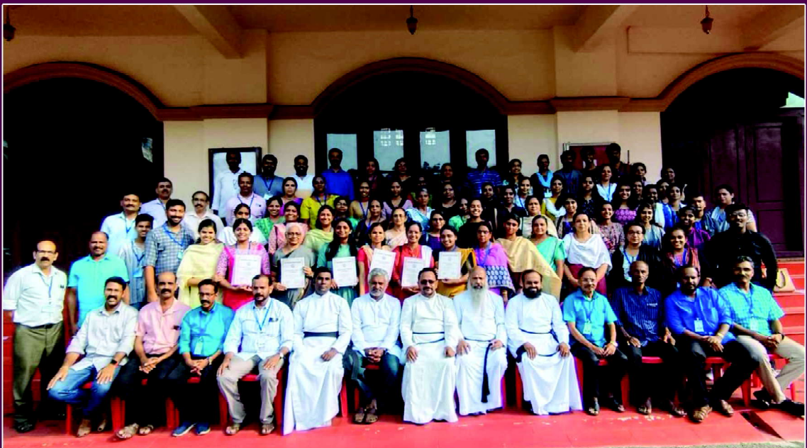
Attendees of Teachers Training Course for Sunday School Teachers