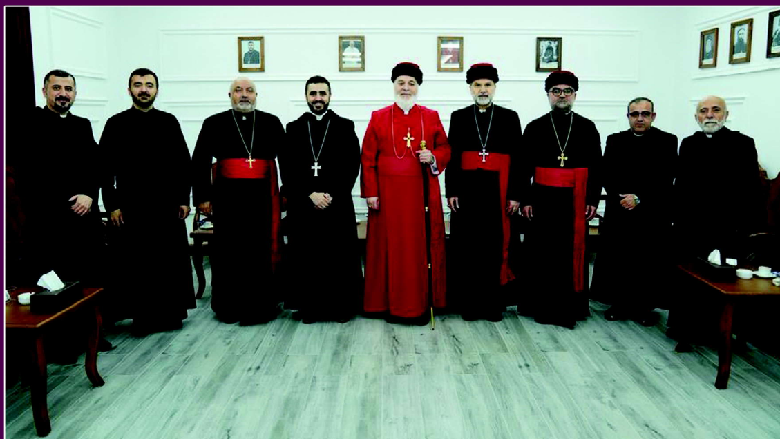
His Holiness Mar Awa III, Catholicos-Patriarch visiting the monastery of The Chaldean Antonian Order of Saint Rabban Hormizd in Ankawa on Wednesday, May 10, 2023