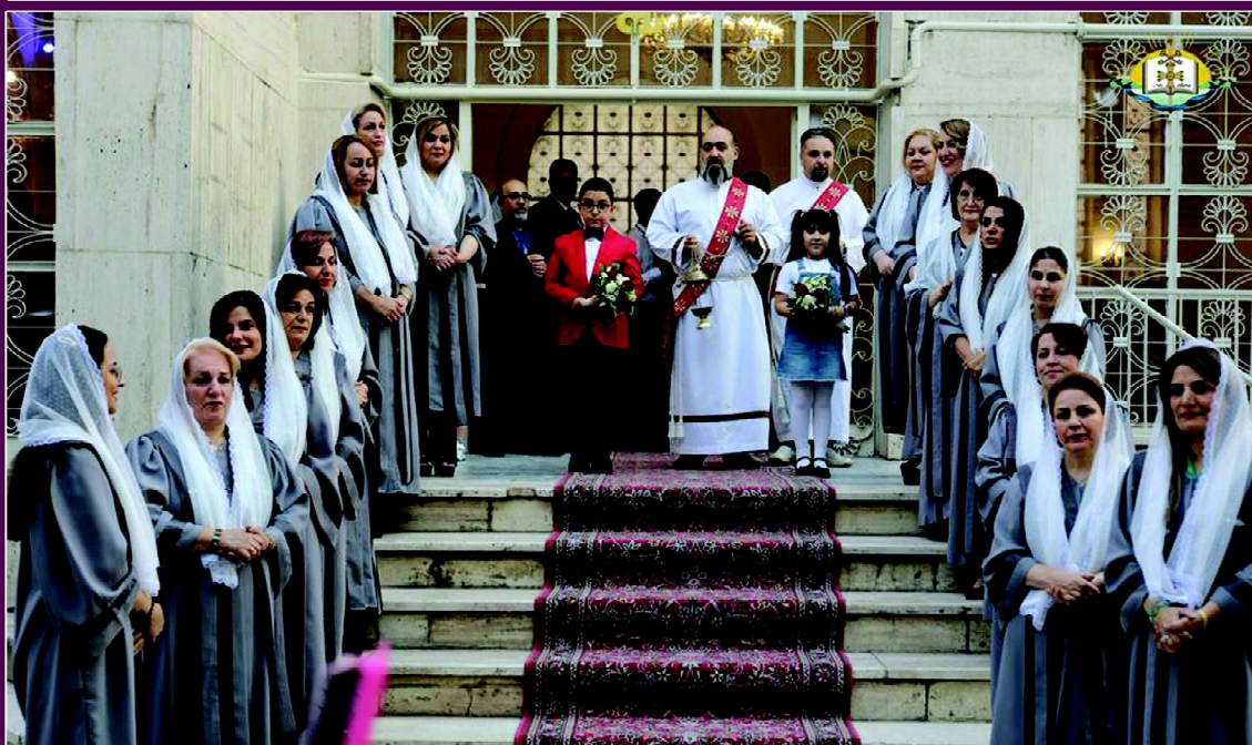
The faithful of Mar Ghevarghese Cathedral waiting to give a warm welcome to His Holiness Mar Awa III during his first visit as Catholicos-Patriarch on Friday, May 12, 2023