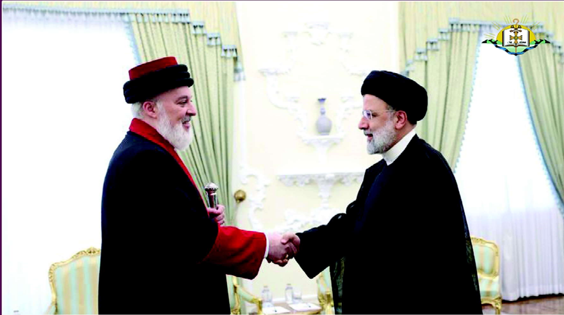
His Holiness Mar Awa III, Catholicos-Patriarch meets Dr. Ebrahim Raisi, President of the Islamic Republic of Iran on Sunday, May 14, 2023