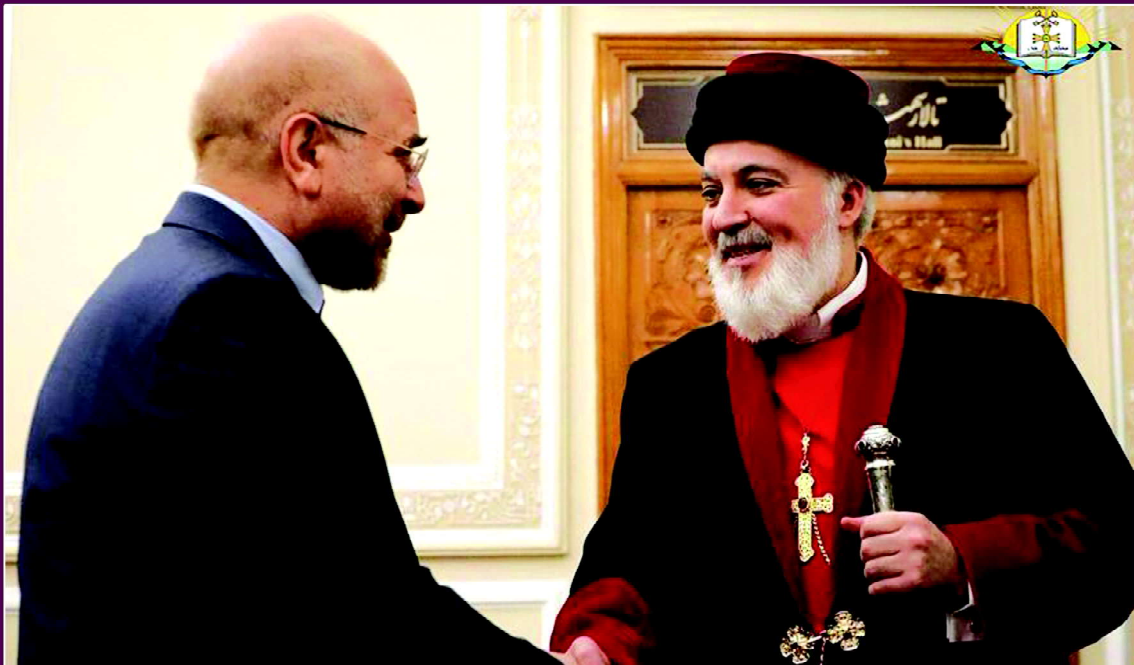
Mar Awa III, Catholicos-Patriarch meets His Excellency Mr. Mohammad Bagher Ghalibaf, Speaker of the Islamic Parliament of Iran.