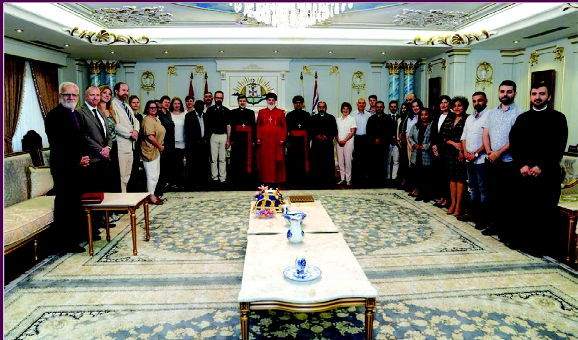
His Holiness Mar Awa III, Catholicos-Patriarch Meets several directors and representatives from Christian and International NGOs