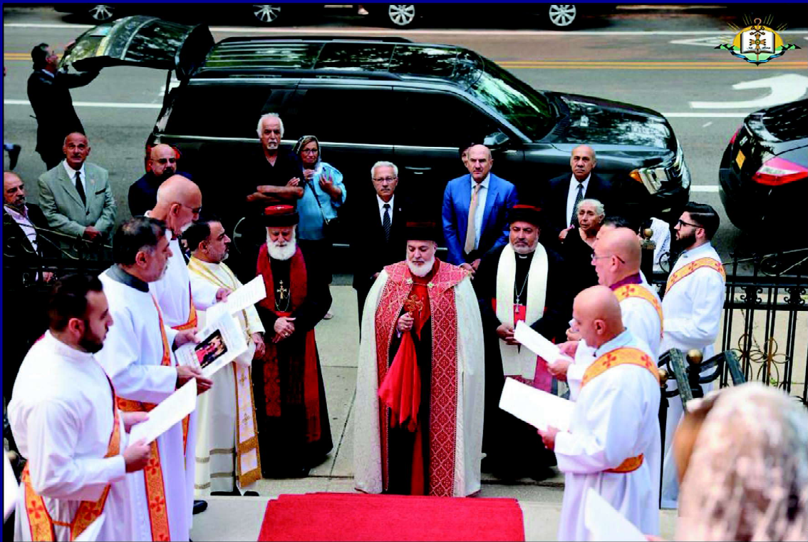
His Holiness Mar Awa III, Catholicos-Patriarch blessing and officially opening the St. Mar Yosip Khannisho Chapel at St. George Cathedral in Chicago, Illinois.