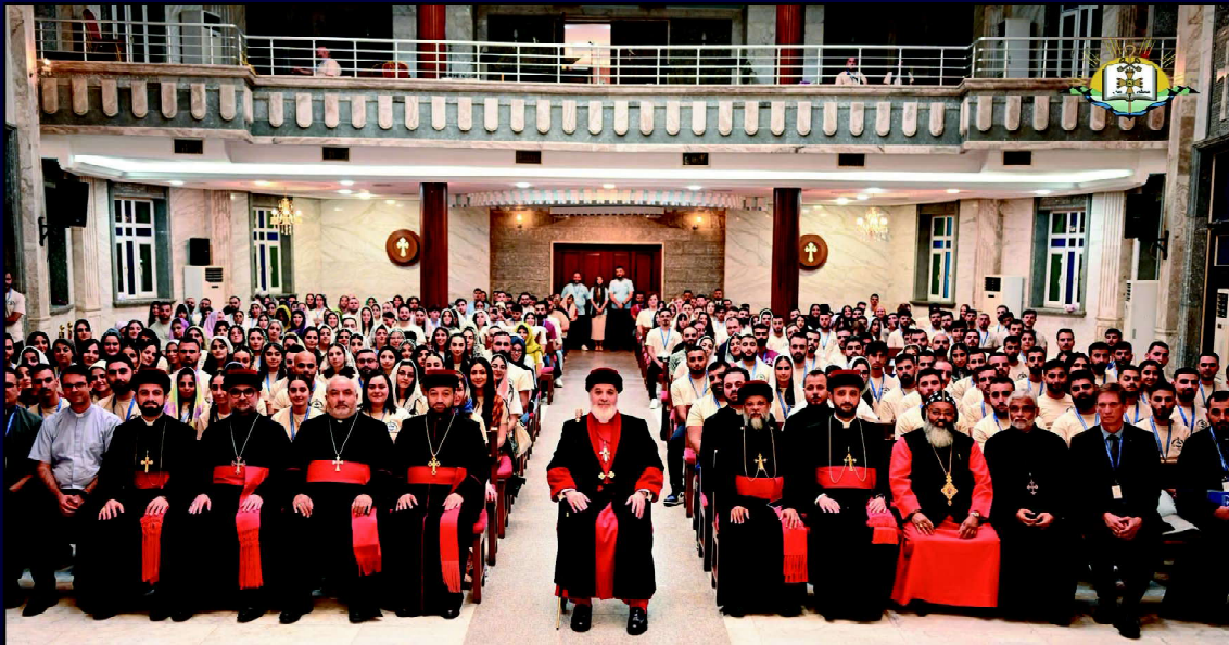
International Youth Conference-2023, Erbil