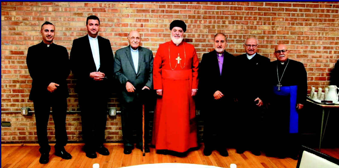
His Holiness participates in the 1200th Anniversary Symposium of Patriarch Mar Timothy in Chicago.