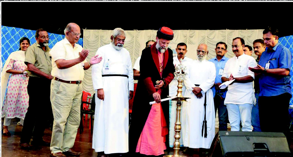
HB Mar Awgin Kuriakose Metropolitan inaugurates the Family Meeting of the Men's Association members of the Church of the East in India