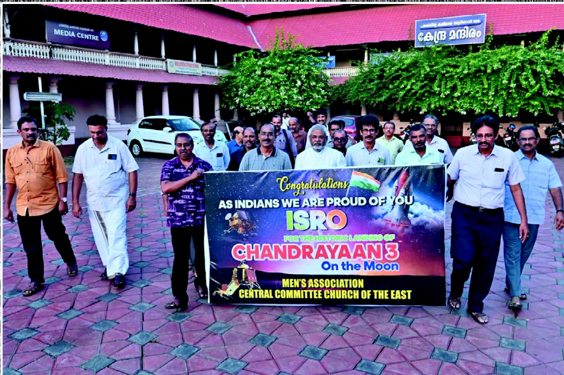
Men's Association of Chaldean Syriac Church of the East in Thrissur celebrates the historic success of Indian lunar mission Chandrayaan 3