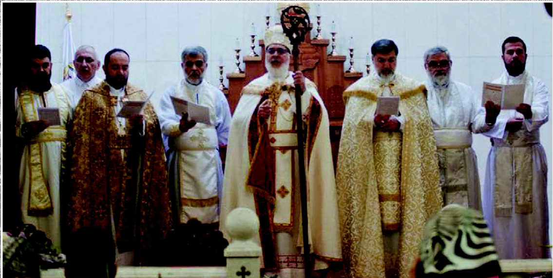
Catholicos-Patriarch His Holiness Mar Awa III consecrates the altar of the renovated Mart Mariam Church in Moscow on 29 October 2023