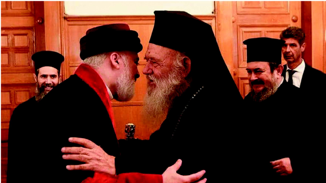
Catholicos-Patriarch His Holiness Mar Awa III, met His Beatitude Ieronymos II, Archbishop of Athens and All Greece at the headquarters of the Orthodox Church of Greece, in Athens on 5 October 2023