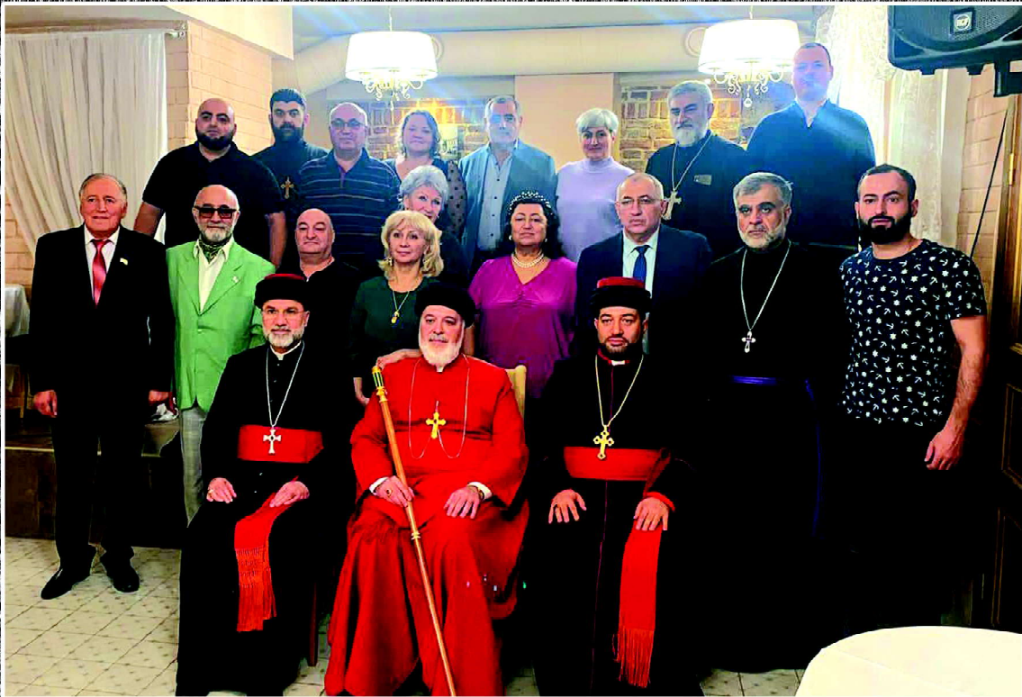
Catholicos-Patriarch His Holiness Mar Awa III meets the Assyrian community of the city of Vladimir, Russian Federation on 27 October 2023