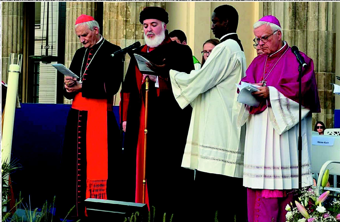
Catholicos-Patriarch HH Mar Awa III addresses a gathering of spiritual leaders in connection with the international meeting of Sant'Egidio in Berlin on September 11-12, 2023.