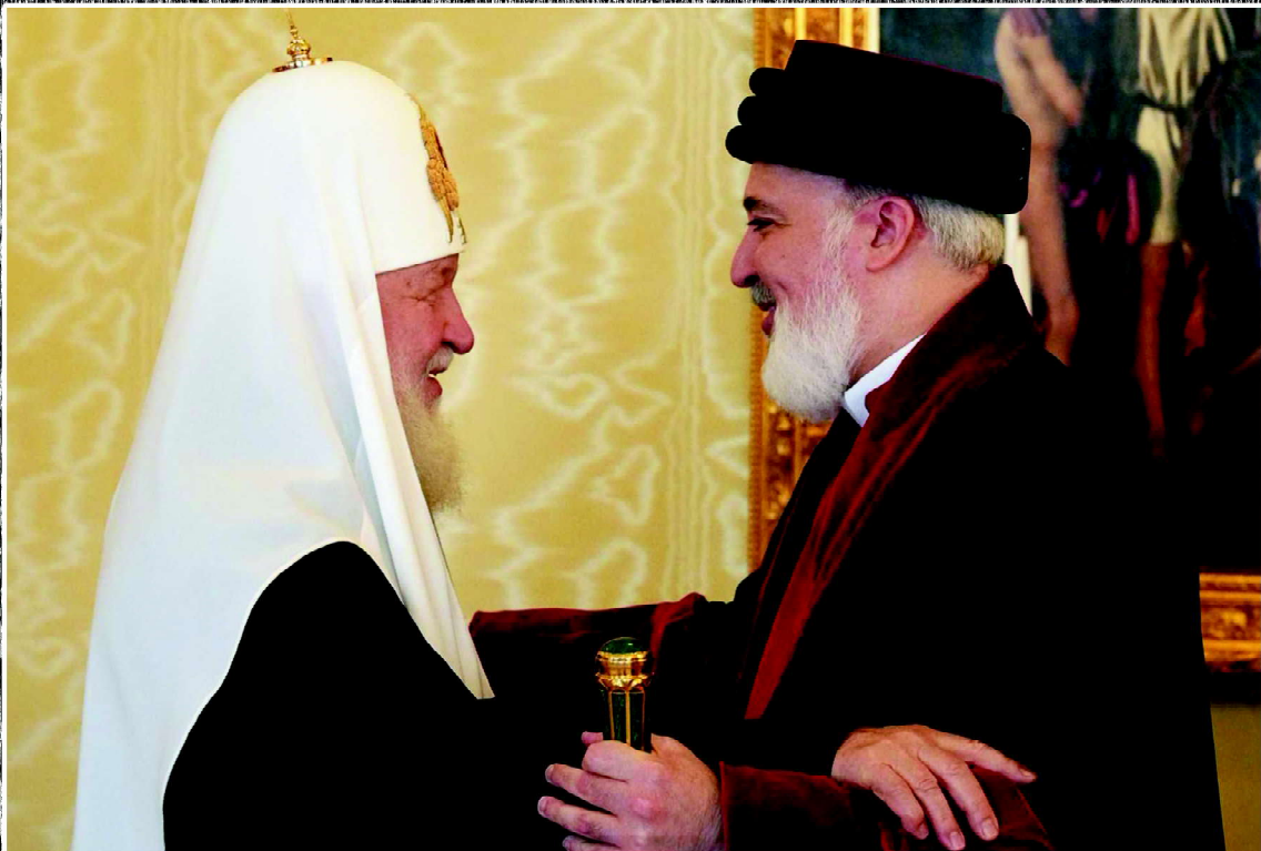
Catholicos-Patriarch His Holiness Mar Awa III received by His Holiness Patriarch Kirill of Moscow and All Russia at the St. Daniel Stavropegic Monastery in Moscow on 31 October 2023